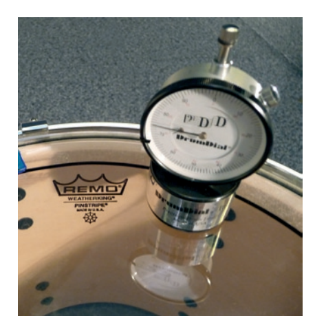
Drum tuning is a skill that can defeat novices. and devices such as the Drum Dial can provide valuable help.

we endeavour to capture, because they are the one over which we have most control. Drum tuning is an art in itself and its importance cannot be overlooked, as even the best-quality drum kit on the market is still going to sound poor unless properly tuned. Usually I'll take the opportunity to get a kit tuned before getting into the studio, as this can be a lengthy process.