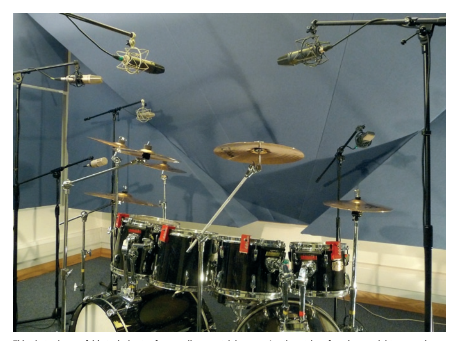
This photo shows a fairly typical setup for recording a metal drummer. In other styles of music one might use a pair of overheads as the main foundation of the drum sound, but here, the mics above the kit are serving primarily as spot mics for individual cymbals. Note also the D-Drum triggers, used to provide spill-free signals for triggering samples at the mix.

Moving onto the overheads, my mic technique here will always be dictated by the number of cymbals being used, which, within the extreme metal genre, can be quite high. Much of the energy and driving edge of the production style is provided by the cymbals, and it is imperative that the dynamics between them are as evenly balanced as possible.