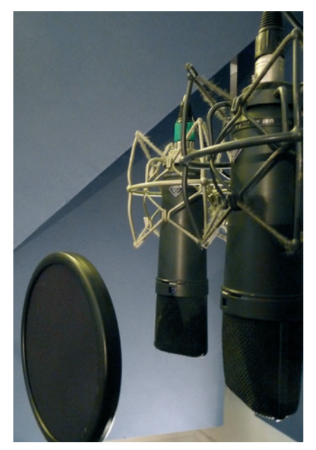
Metal vocalists often operate over a huge dynamic range, and it can be beneficial to record two microphones: a close mic for the intimate, quiet moments and a distant mic for full-on screaming.

Properly capturing the wide dynamic range of a metal vocalist can be a problem. Corey Taylor from Slipknot, for example, sometimes goes from a whisper to a full-on scream within a single line. This can make it challenging to get a sufficiently intimate vocal sound and full recording level on the quieter sections. I will often compress vocals when tracking, but even this won't necessarily capture the subtleties of the performance correctly. To deal with this, and to allow for continuity of vocal performance, set up two microphones at different distances from the vocalist and record them on separate tracks. The closer of the two will be used for the quieter. breathier sections, with the mic gain set accordingly. Chances are that on the louder sections, the recording from this close mic will clip as a consequence, but the other recording should have a perfect level for the louder section. This option of moving between the two mics allows for a lot of flexibility during the mix.