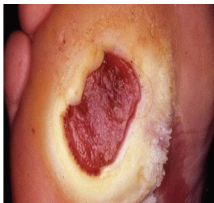
Figure 4. Painless neuropathic ulcer on the ball of the foot.

In people with diabetes, neuropathy can involve all the different types of nerve fibre: