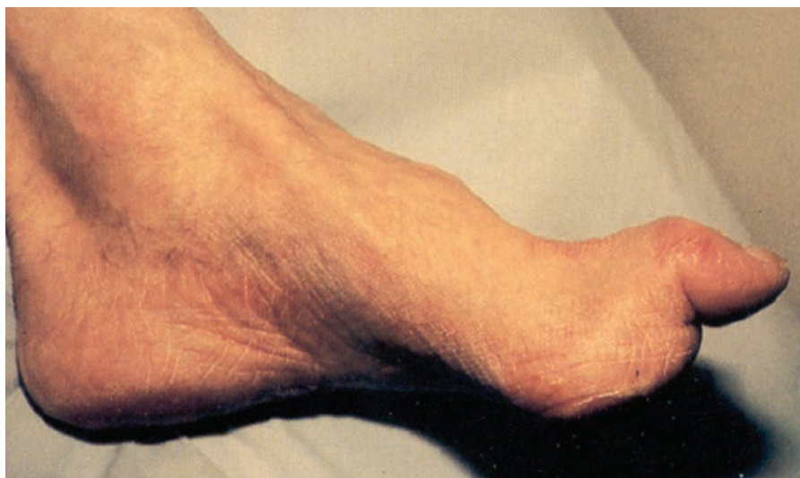
Figure 2. Typical clinical presentation of foot affected by polyneuropathy.