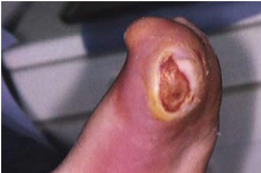
Figure 5. Painful ulceration on the ball of the foot.

response to the application of deep pressure, the pain may be interpreted at a site remote from the site of application