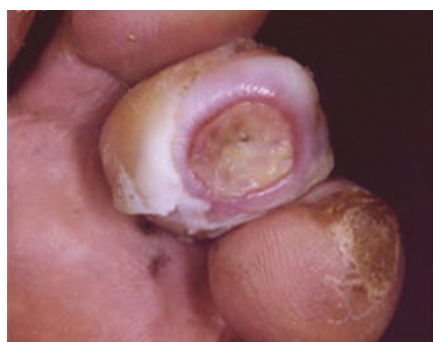
Figure 3. Painless neuropathic ulcer on the end of the toe.