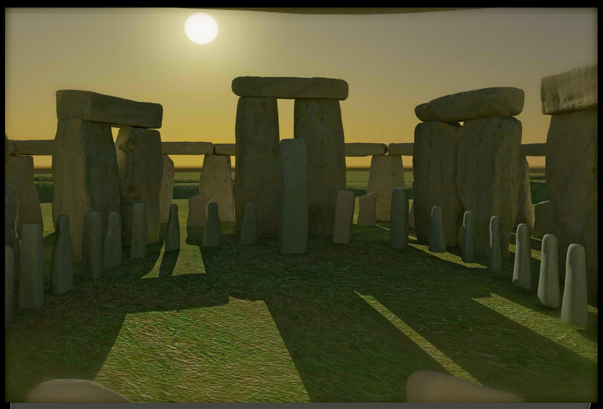
Figure 1: 3D CG Stonehenge model phase 3c.