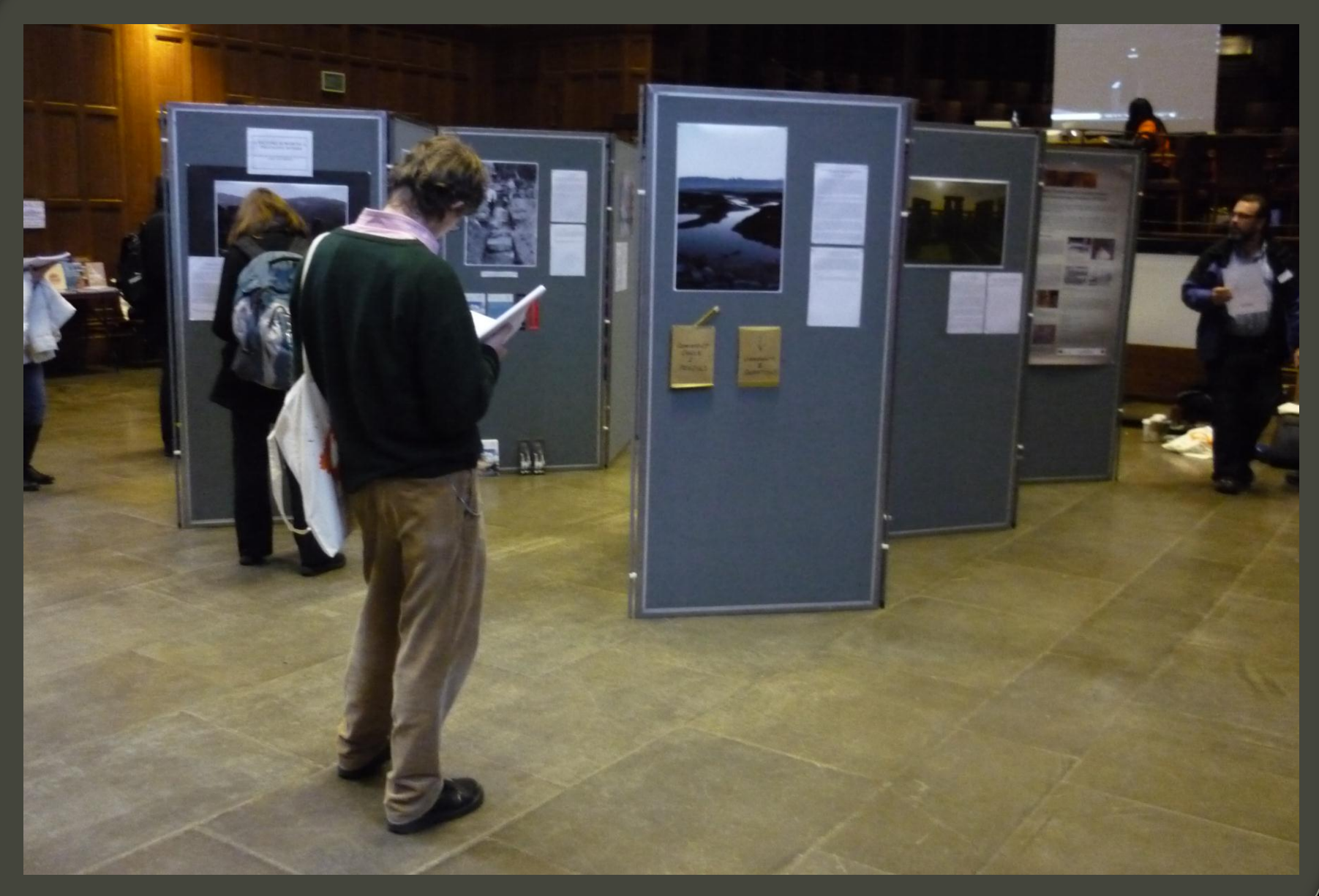
Poster Exhibition at TAG 2010 Conference in University of Bristol, UK