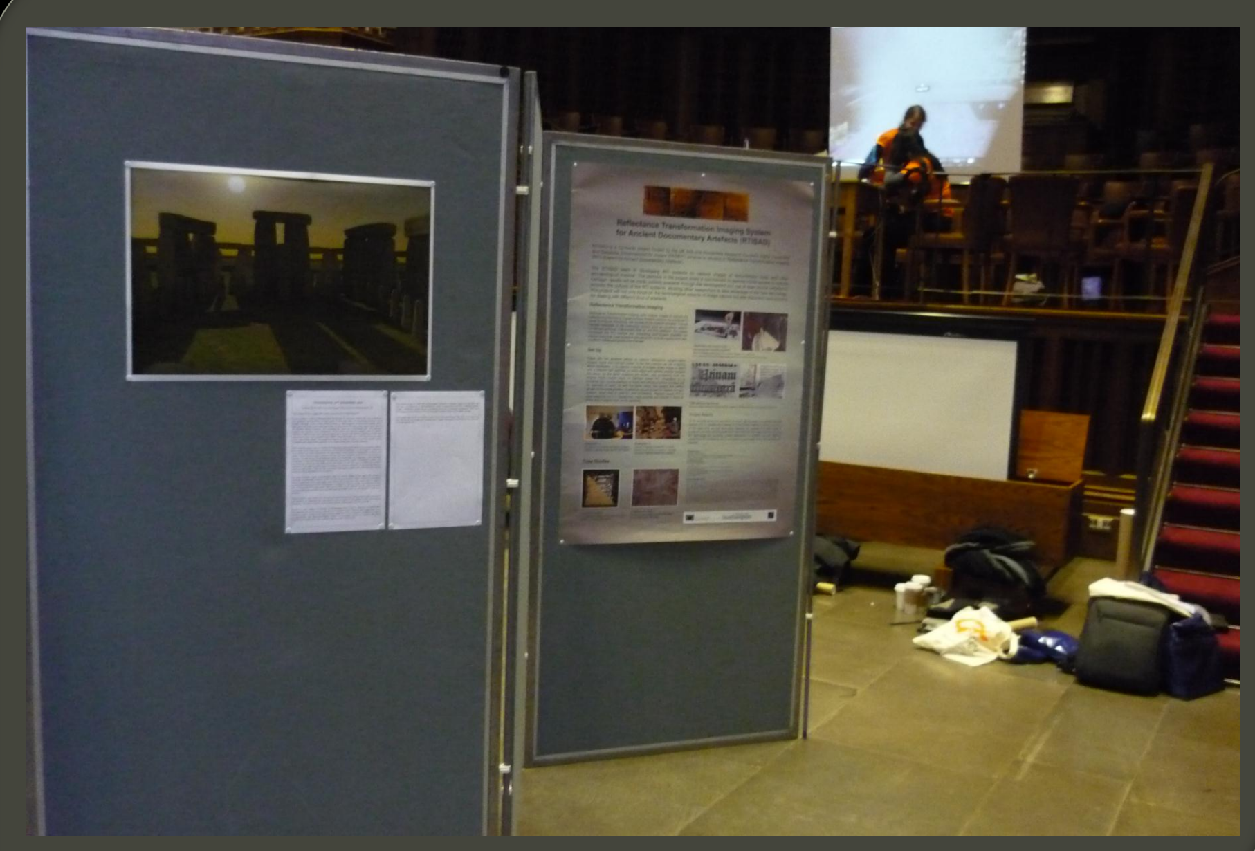
Poster Exhibition at TAG 2010 Conference in University of Bristol, UK