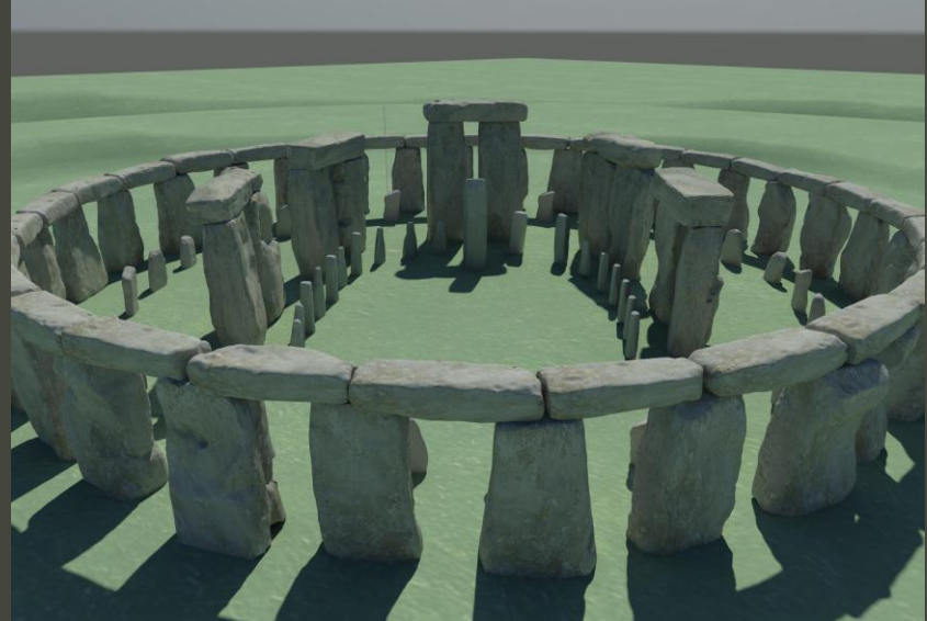
Development work-in progress 3D CG model of Stonehenge