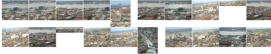
Fig. 2. The screenshot shows the top 20 results of a combined ranking. The query image ( upper left ) is ranked highest. Similarity decreases from left to right and top to bottom.

This keyword represents the not content based queries in section 2. The search engine now has two independent views to calculate the final ranking. Figure 2 shows the resulting image set. The weighted ranking is displayed in figure 3 listing the detailed ranking for the first 125 images. To refine the result set, the weights w^f for each of the three modules have been adjusted manually.