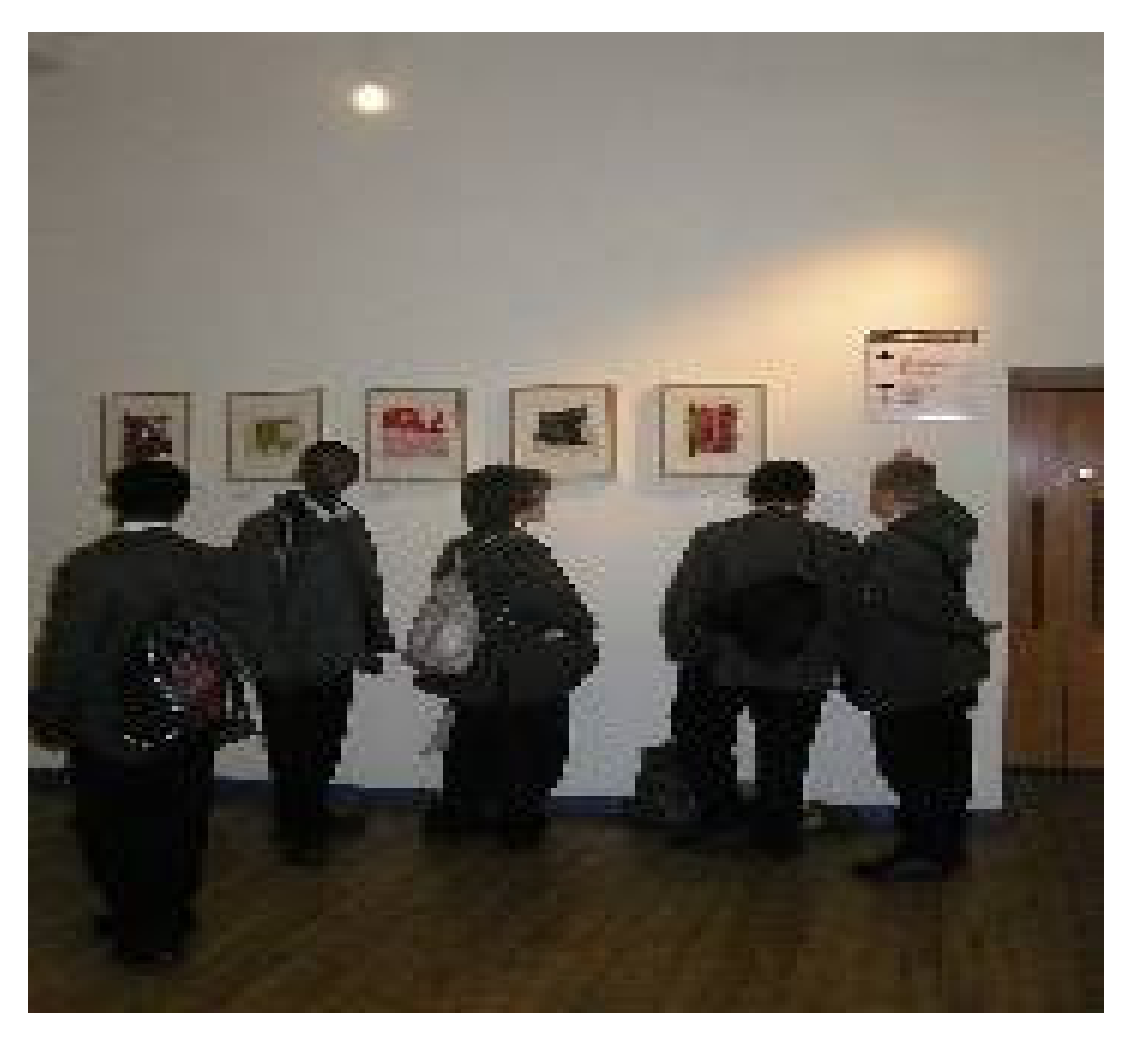
Figure 5. The boys viewing their completed tapestry samples at 'Education in Tapestry' Dean Clough Gallery Halifax.

In the paper artists' perspectives on art practice and pedagogy Emily Pringle discusses t