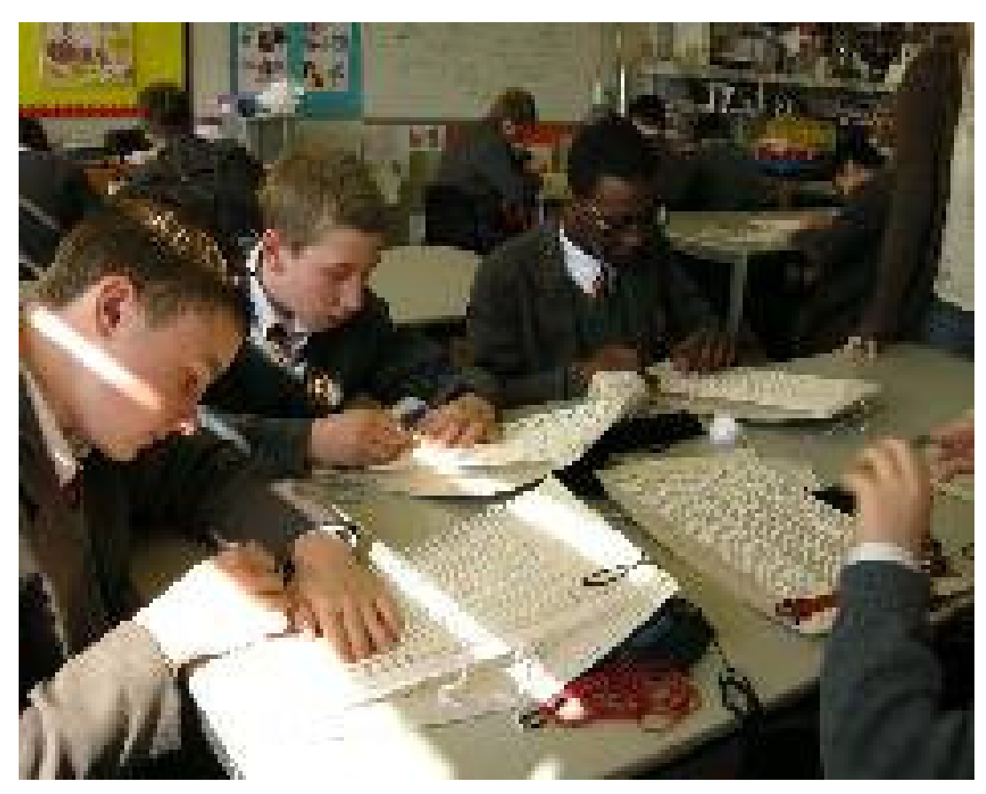
Figure 4. A group of boys from All Saints Catholic School Huddersfield, making tapestry samples.