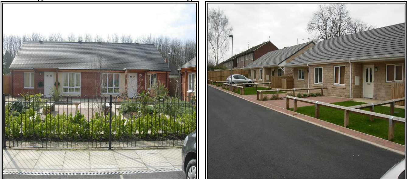
Figure 2: Two of the Best Performing SBD Estates (Visual Audit Results)

Of the 32 developments analysed, the best performing five developments (i.e. those with the lowest scores) were all SBD. The worst performing five developments (i.e. those with the highest scores) were predominantly non-SBD (only one was SBD).