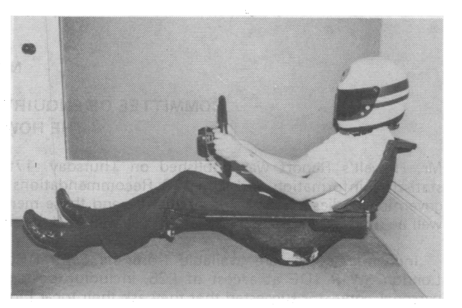
Fig. 2: A driver in-situ in the seat – showing angles of backrest, neck, arms and legs.