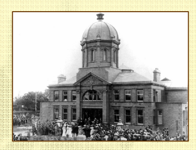
Opening Ceremony of Dorman Memorial Museum, Middlesbrough

As well as highlighting the extent of the steel magnates role in the town, the research will assess the significance of differing political, economic, religious and cultural views in relations between Middlesbrough's industrialists.