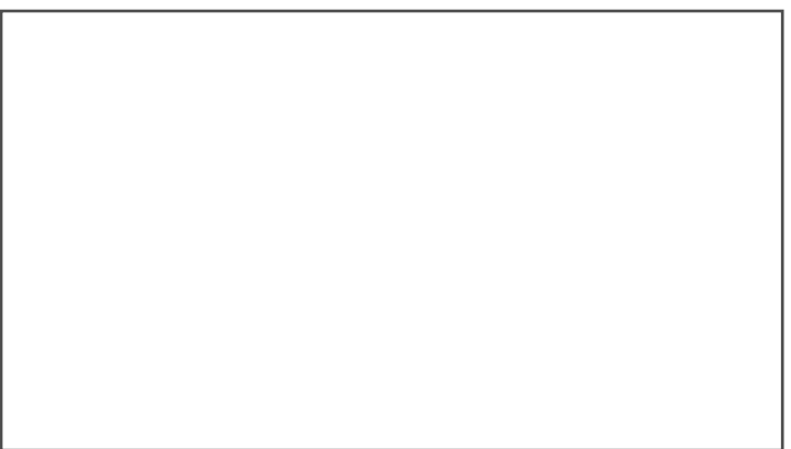
Figure 3. Average days in trade credit (using the Proxy) from 1998 to 2007: UK FTSE case.

In addition, the liquidity problems of UK firms increase because the availability to credit banking and capital markets has reduced with the credit crunch. The results of the survey made by Confederation of British Industry (CBI) to analyze the situation of firms in UK in terms of credit conditions show the availability problem to get external funds. The used sample in 2009 is 113 firms of difference size, small and medium (0-240 employees), large (250-4999 employees) and very large (more than 5000 employees). The results show that eight in ten very large firms reported deterioration in credit availability, and 63% of small and medium-sized enterprises and over half of large businesses have experienced a reduction in credit availability since the beginning of the credit crunch. So, the availability of credit to the corporate sector has worsened over the past quarter, and over the next months a further similar deterioration in the availability of credit is expected. Moreover, the weak accessibility to external funds