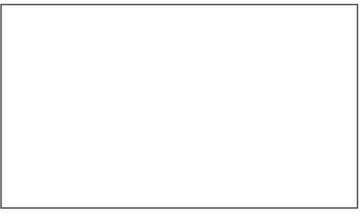
Figure 2. Average number of days used to pay suppliers (Directors' Report Proxy): UK Plc firms in 2008.

Currently, more than the middle of large firms are using more than 40 days to pay suppliers, and 20% of them use more than 70 days (See Figure 2), but around 53% of the sample uses less than 40 days to pay suppliers and 36% of the sample less than 30 days, a significant data. The payment policies with the support of banks and firms association as Federation of Small Businesses (FSB) or Confederation of British Industry (CBI) are trying to reduce the days used to pay suppliers to 10 days, but only a 6.77% of Plc firms already use 10 or less than 10 days to pay suppliers, thus the change in the reduction of days used to pay suppliers have not to be easy. For the moment, the Government and some association as Universities have accepted this initiative, and they have committed to pay in 10 or less days to suppliers.