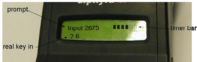
Figure 4: Example of prompt, timer bar and real keystrokes