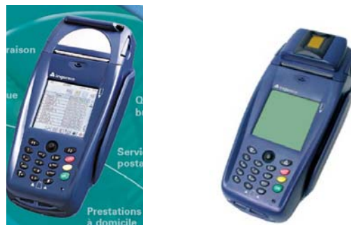
Figure 1: Example of POS device from Ingenico (a) without fingerprint sensor (b) with fingerprint sensor