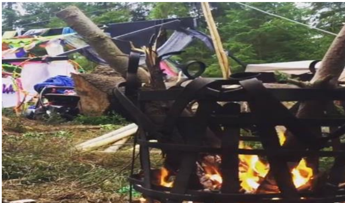
Figure 1 NW Psyculture - cauldron

in stating that 'psytrance offers an opportunity to take a break from every day busy life and reflect on one's own personal journey' while alternatively Interviewee 13 refers to beliefs as a 'collective communion and transcendence through music'.