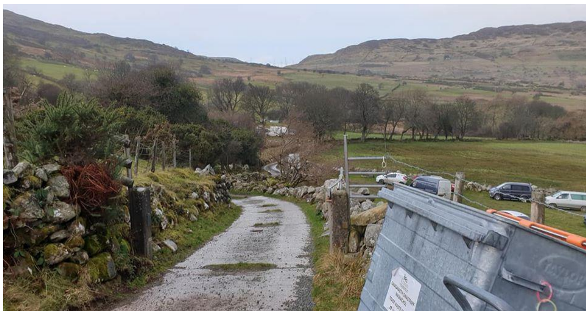
Figure 3 NW Psyculture - NYE 2019 - the location

In response to questions about the New Year's Eve Gathering, participants characterised it as super, friendly, excellent, and enjoyable as well as amazing, colourful, and memorable. Others refer to a sense of community and belonging that result in a wish to return, noting 'how close the tribe is, and how everyone knows everyone' (Interviewee 10). Another also refers to the tribal sense of belonging, the experience of togetherness and connectivity indicating that the people who attend make it unique; that it feels 'like being home, tribal', where they feel 'absolutely in the zone and connected!' (Interviewee 6). Interviewee 9 stated they were made to feel very welcome like 'one big family that keeps growing: one friendly close-knit group'. The choice of remote locations that are both beautiful and isolated are key factors in participants' accounts of how it attracts them to continuing to attend such gatherings (Figure 3).