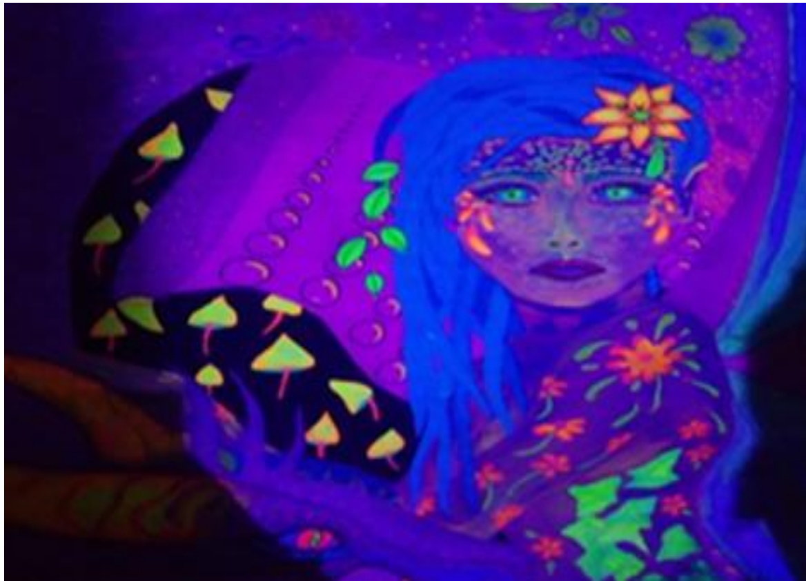
Figure 4 NW Psyculture - UV artwork

Furthermore, there were a combination of global and local influences evident as well as some unique elements such as references pirates and faeries: 'the pirate ship is the symbol of the tribe' and its aspirations that one day they 'will build an actual ship so that come the revolution we can all sail away'. Along with other pirate motifs, there is the ship's cat who epitomises the experiences of the human travellers: 'Eclipse is the second cat that comes on the Captain's van everywhere they go. It is a unique cat in that it freely wanders off in all sorts of wild and remote locations, happily remembering which van is hers, striding gallantly on top of the van as if it is her ship'. Other features include handmade décor representing the organisers who represent as a faery and a pirate, the cat (Figure 4), and psychedelic colours in the artwork within the Faery décor (such as in Figures 5 and 6).