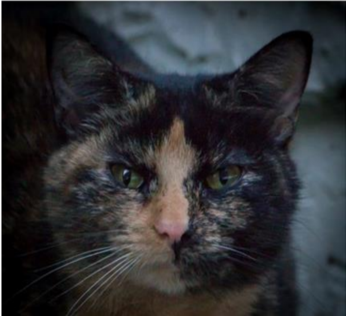
Figure 6 NW Psyculture - The Ship's Cat

The personal intention at this gathering was to reap the benefits of togetherness on the dancefloor where the physical relief gained through experiencing trance, transformation and transition were aided by the immersive environment: