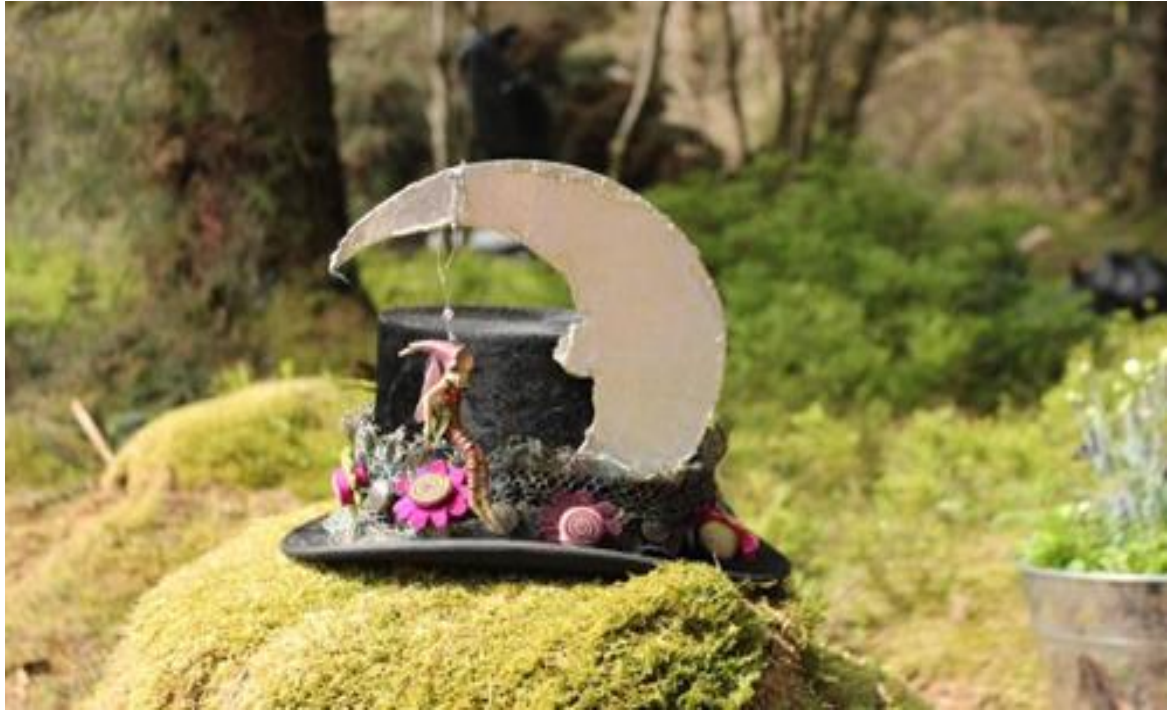
Figure 8 NW Psyculture - art, symbols and decor