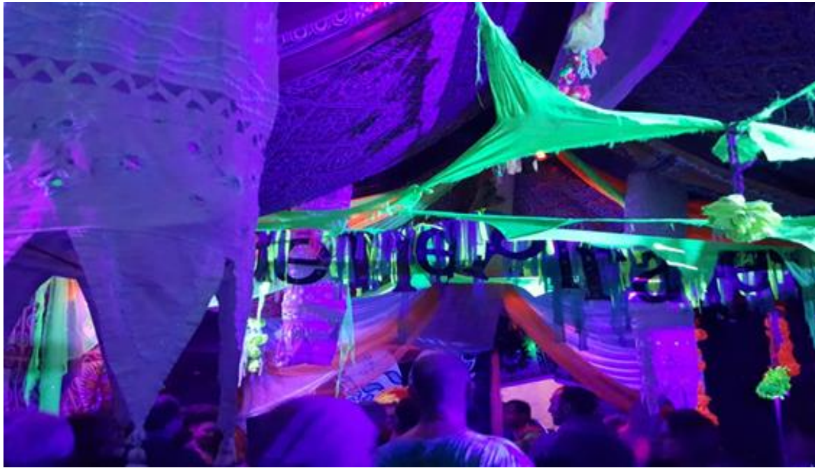
Figure 5 NW Psyculture - Immersive UV decor

The values of looking after each other were underpinned by people being available to act in times of crisis, for example when: 'someone was having a hard time and didn't have their car near to escape to' (p. 1).