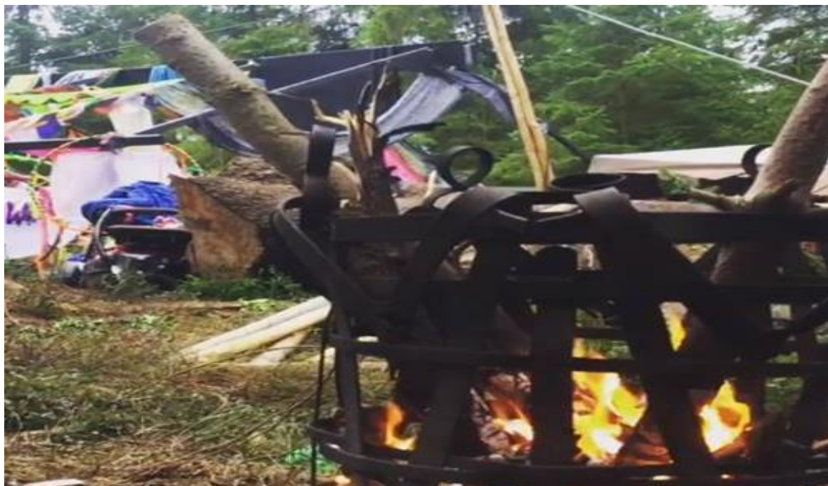
Figure 1 NW Psyculture - cauldron

in stating that 'psytrance offers an opportunity to take a break from every day busy life and reflect on one's own personal journey' while alternatively Interviewee 13 refers to beliefs as a 'collective communion and transcendence through music'.