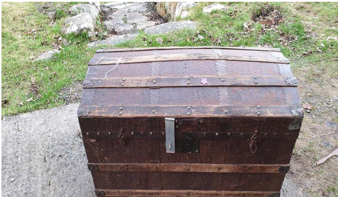
Figure 9 NW Psyculture - the Captain's chest