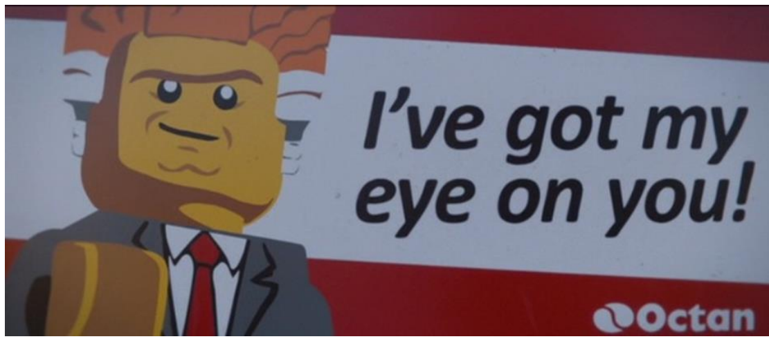
Figure 6: Subjugated knowledges in The Lego Movie: Surveillance