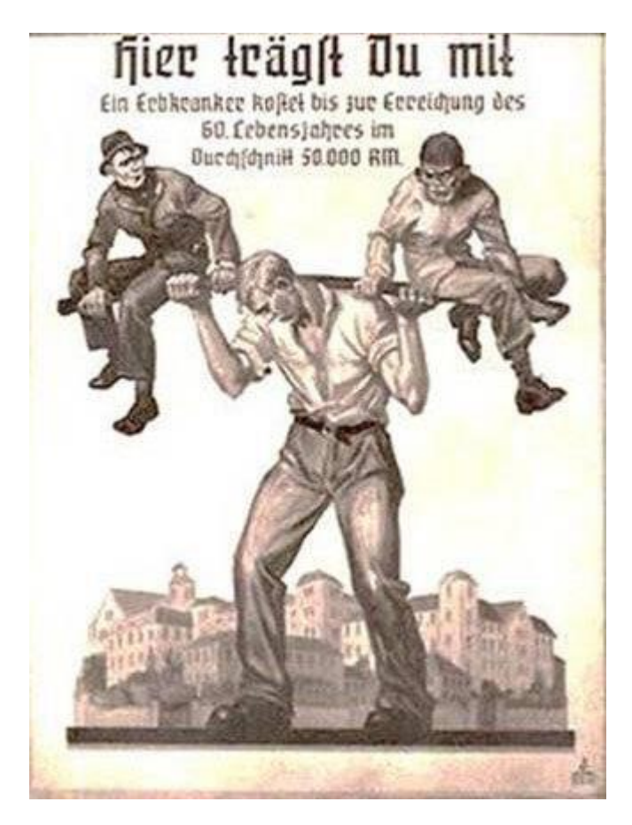
Figure 1: A Nazi propaganda poster expressing the idea that people with both physical and mental disabilities are a burden to the German Nation

Euthanasia was soon expanded to include non-German adults who were deemed to be 'unworthy of life', including the mentally ill, criminals and the disabled, who were targeted by Hitler's euthanasia programme – the T4 programme. This was rationalised by a belief that such groups were burdensome and of no use to society when unproductive and unable to work, as they drained resources from the state (Figure 1).