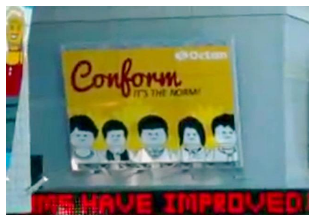
Figure 7: Subjugated knowledges in The Lego Movie: Conformity

In relating the above discussion to the loss of self, which was discussed in Chapter 9, an explanation emerges regarding the sense of existential crisis that was constructed in participant accounts. Whilst neoliberalism offers itself as the route to happiness, freedom and a fulfilled self, commodities do not satisfy such needs but distract from them. Neoliberalism is ultimately an ideology which makes use of disciplinary practices, such as shame (Chapter Eight) and the search for a sane self in an insane society and self-338