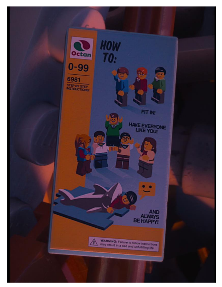
Figure 5: Instructions on 'How to fit in, have everyone like you and always be happy': The Lego Movie

The instructions dictate everything from private to public life, incorporating how consumerism must be practised, centred around conformity and social desirability. Though consumer capitalism is hidden behind an illusion of freedom, happiness, and fulfilment, the conformity it produces is veiled with a more direct, ominous threat of the implications of subverting the status quo, as demonstrated in one scene: