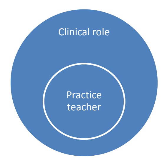
Figure 2 Dominance model (Roccas and Brewer 2002)

An alternative model presented by Roccas and Brewer (2002) suggests the dominance of a particular social identity over all other identities (figure 2). The subordinated identities are embedded within the dominant identity and considered aspects of self rather than an alternative identity. Existing literature suggests that practice teachers have a dual identity where the clinical role identity dominates the secondary or subordinate practice teacher identity (Newland 2009, McInness 2013, Mannix 2012, Sherwin and Stevenson 2010). It is therefore possible that some practice teachers might continue to define themselves in relation to their dominant clinical role.