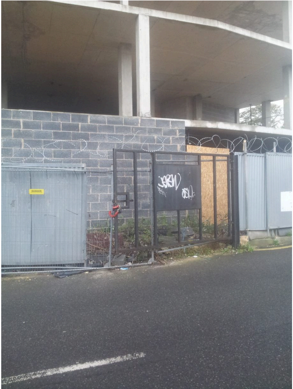
Slide 6 – FB page...