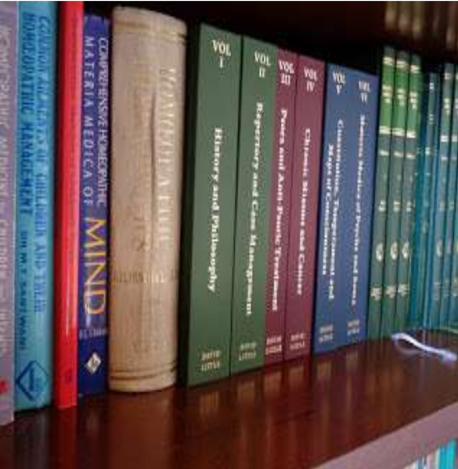
Figure 1: Homeopathy Books (Nourished and Nurtured, 2015)