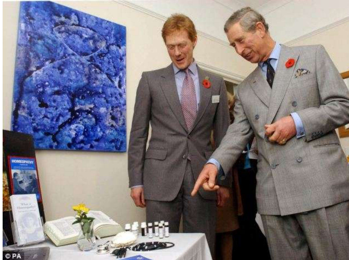
Figure 3: The Prince of Wales with some homeopathic remedies in Poundbury, Dorset in 2004 (Daily Mail, 2004)