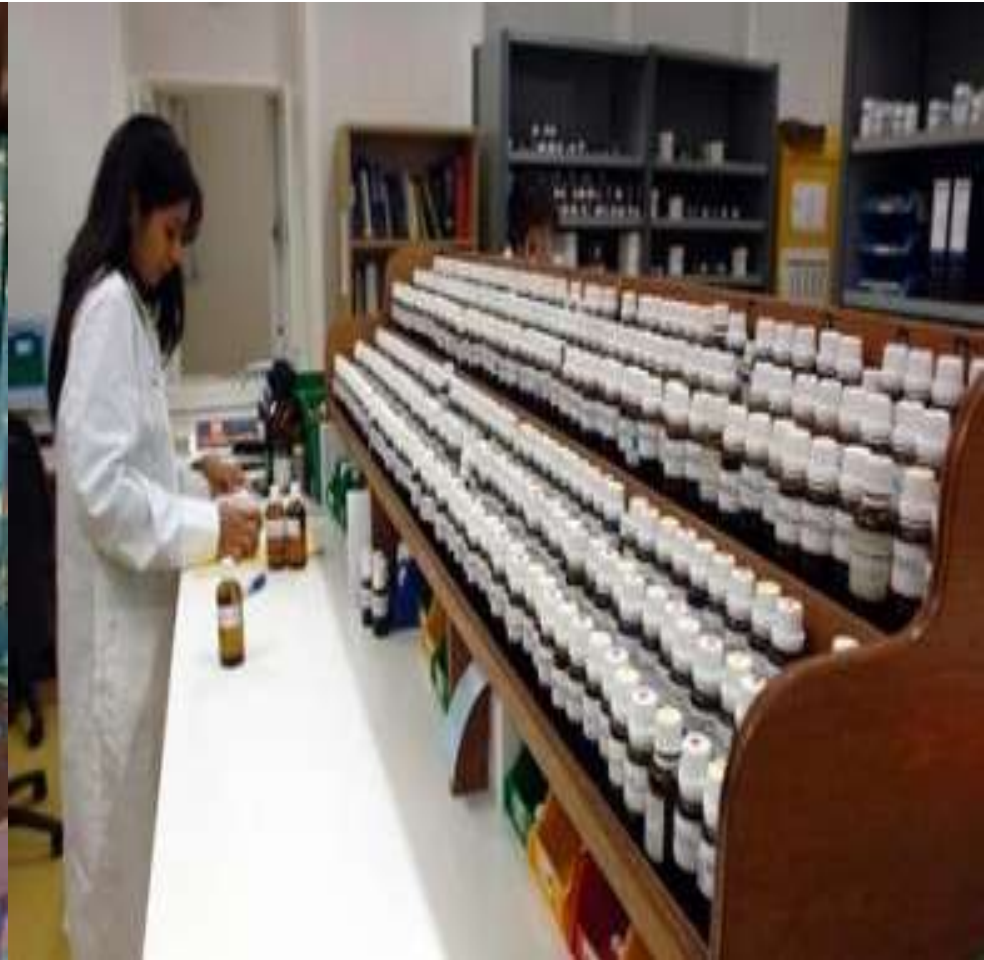
Figure 2: Homeopathic pharmacy (Homeobook.com, 2011)