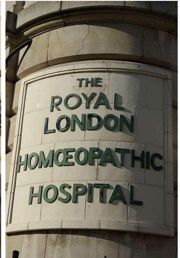
Figure 4: Royal London Homeopathic Hospital Sign (Morris, 2014)