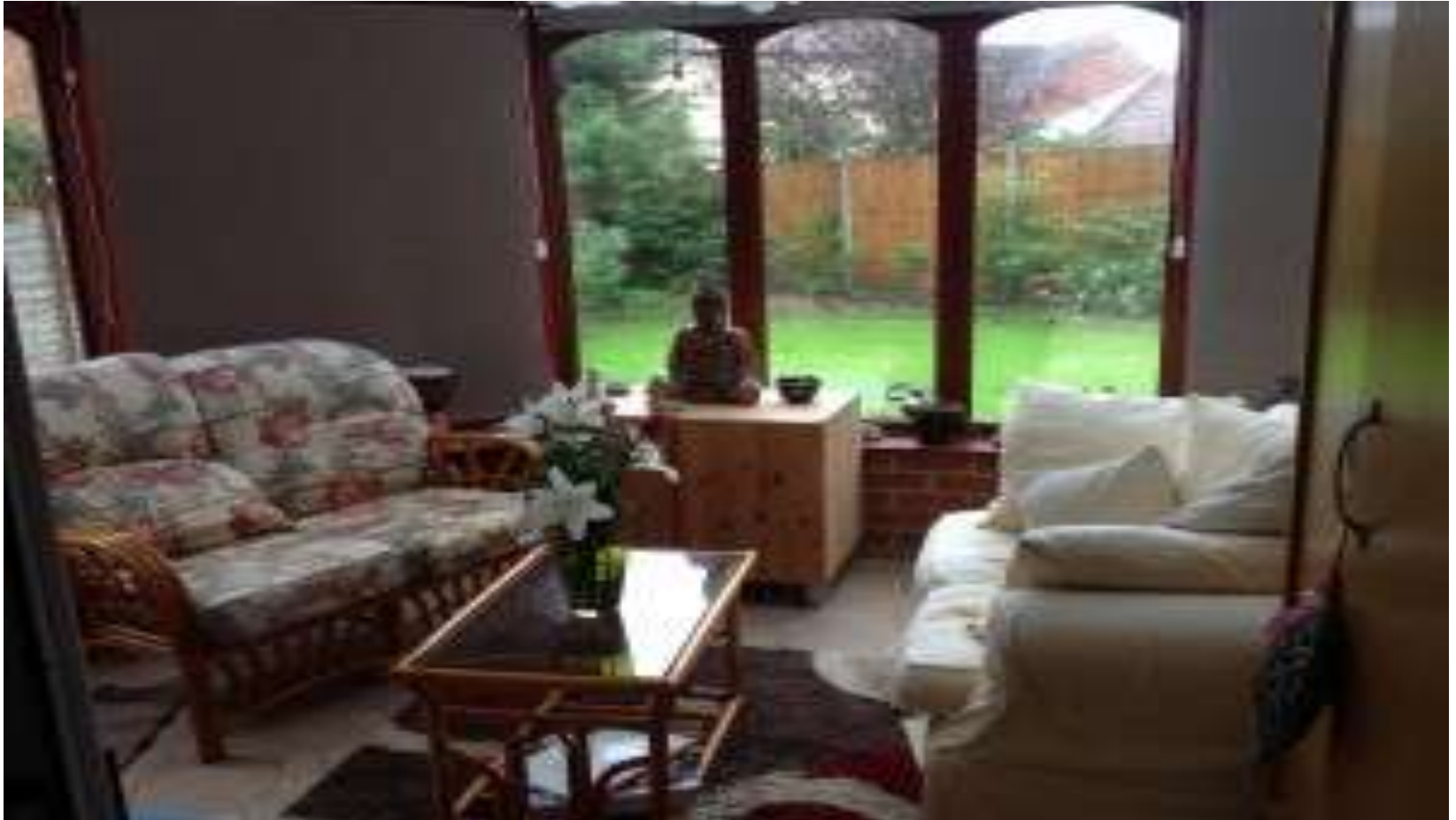
Figure 5: Homeopathy consultation room (Restore Within, 2014).