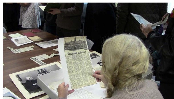
Figure 3 Groups from St Anne's team, identifying areas of research.