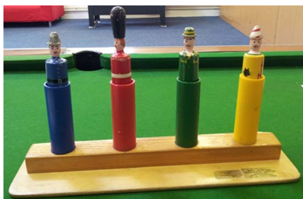
Figure 2 A toy from Leeds Mencap.

Although there are clear parallels in their bids to communicate mental health, and in this case learning disability, the concrete connections between historical endeavour and current practice are not always immediately obvious. Some of this is about the realities of the day job, but equally an agreement on a clear rationale for working together can be an early stumbling block. What these initial thoughts on the process of co-producing outputs have emphasised is the common ground between historians, practitioners and services users and the things we can learn from each other. An understanding of the history of the post-1959 world was important, but on its own it was not enough to draw project partners in. While there may be other pathways to impact for historians of mental health and learning disability, and other ways to communicate the findings of their academic research, working with current stakeholders seems to offer the best and most logical opportunities. Again, most, if not all historians know this already—but in doing so, there are