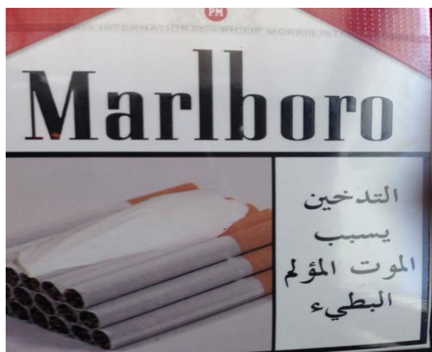
Figure 1: Pictorial Health Warning of an Enshrouded Person over a Stack of Cigarettes

The study is structured as follows. Section 2 provides a review on pictorial health warning and smoking changes literature is undertaken. Section 3 presents the research methodology. In Section 4, findings and discussions are provided, highlighting the conceptual framework for the effect of health advertising on smoking changes. The last section includes conclusions and clarifies contributions made by this study in addition to the authors' recommendations.