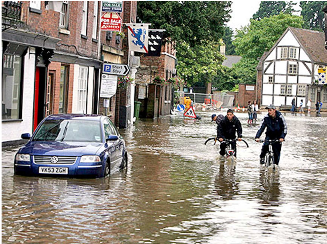
Fig 2. The cycle of recovery