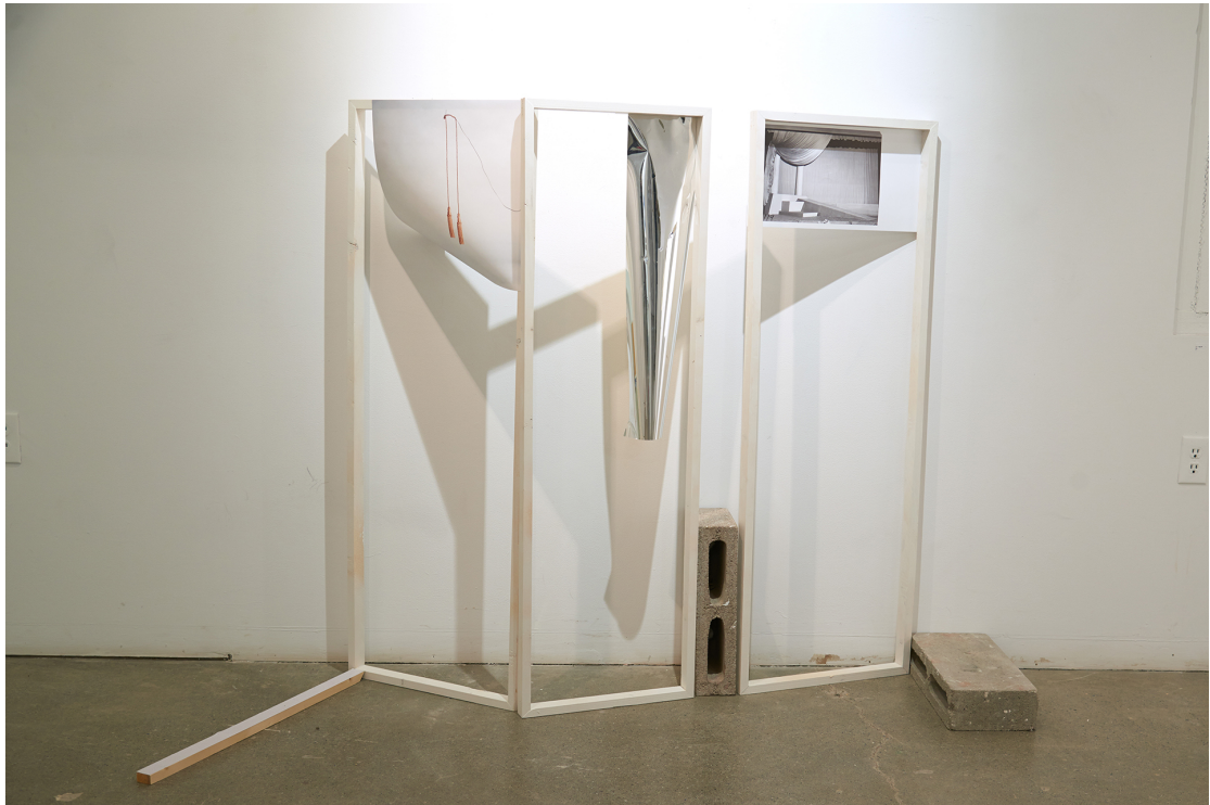
Stage Set: Cool Tone. photographic floor installation, Reclaimed wood, frames, 130x145cm, 2016