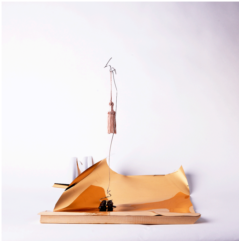
Tassels C, projected stage set, (2016) C-type digital photographic prints, 40x 40 cm

"New Materiality", Artists Residency Banff Arts Centre, Alberta, Canada January - February 2016