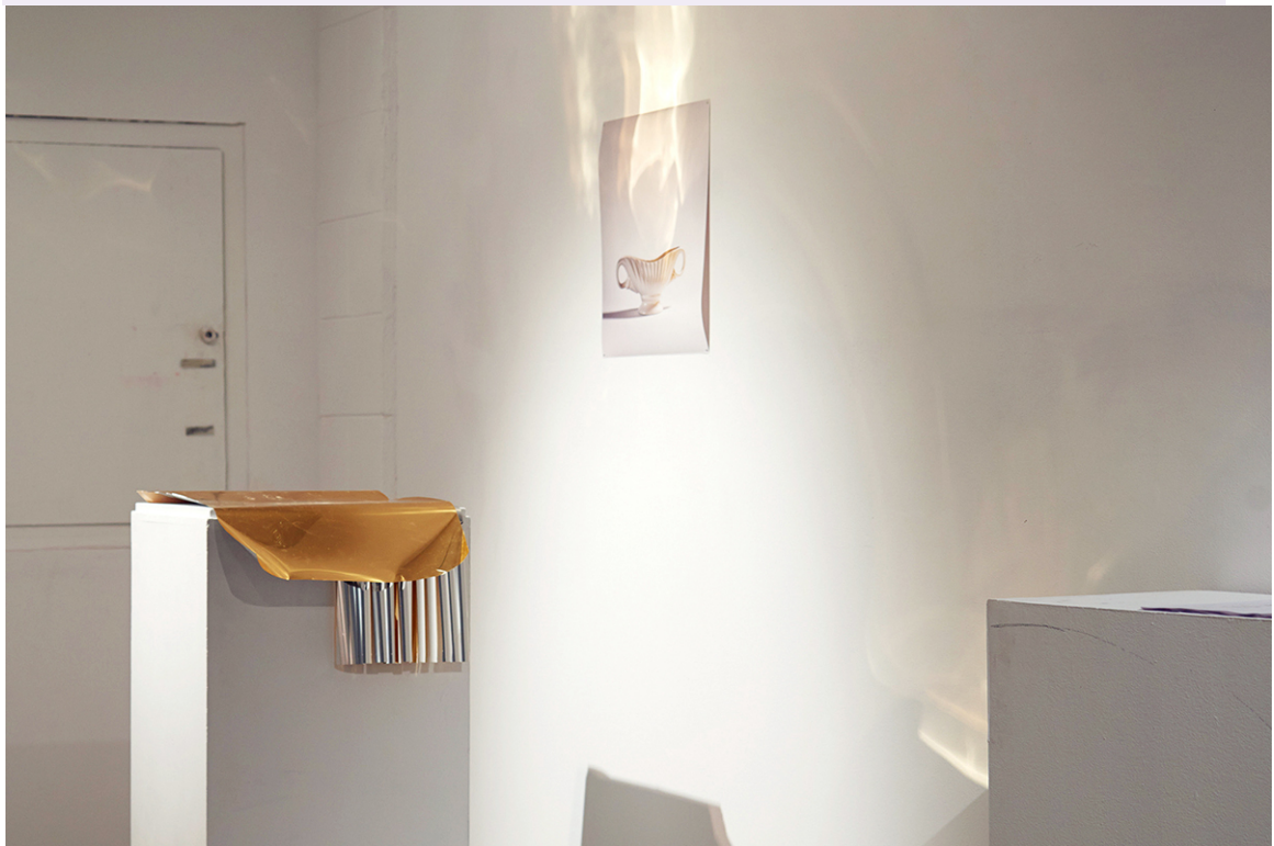
Mantle Vase: reversible C-type digital print, laser-cut gold mylar, 2016