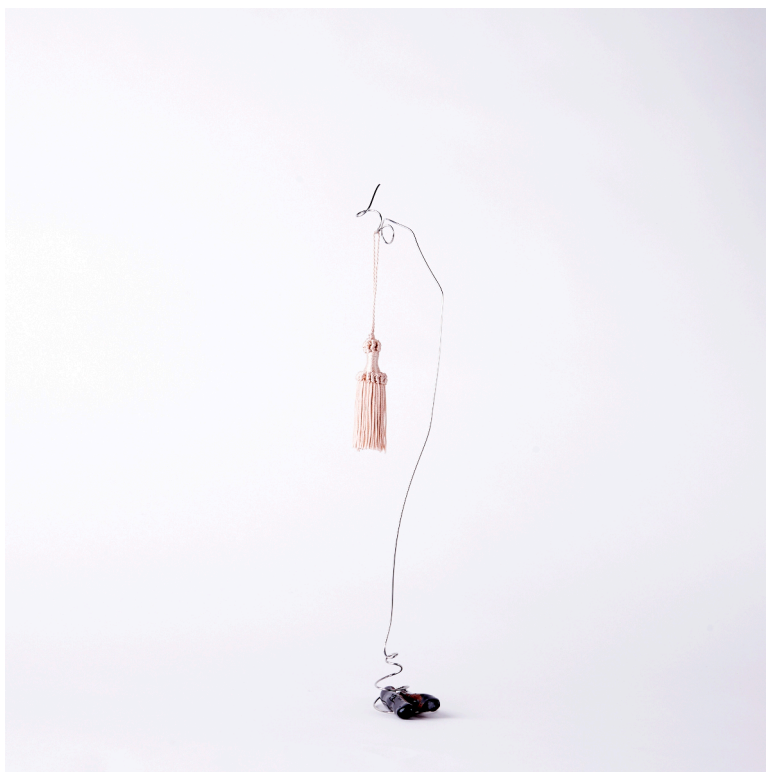
Tassels C, projected stage set, C-type digital photographic prints, 40x 40 cm