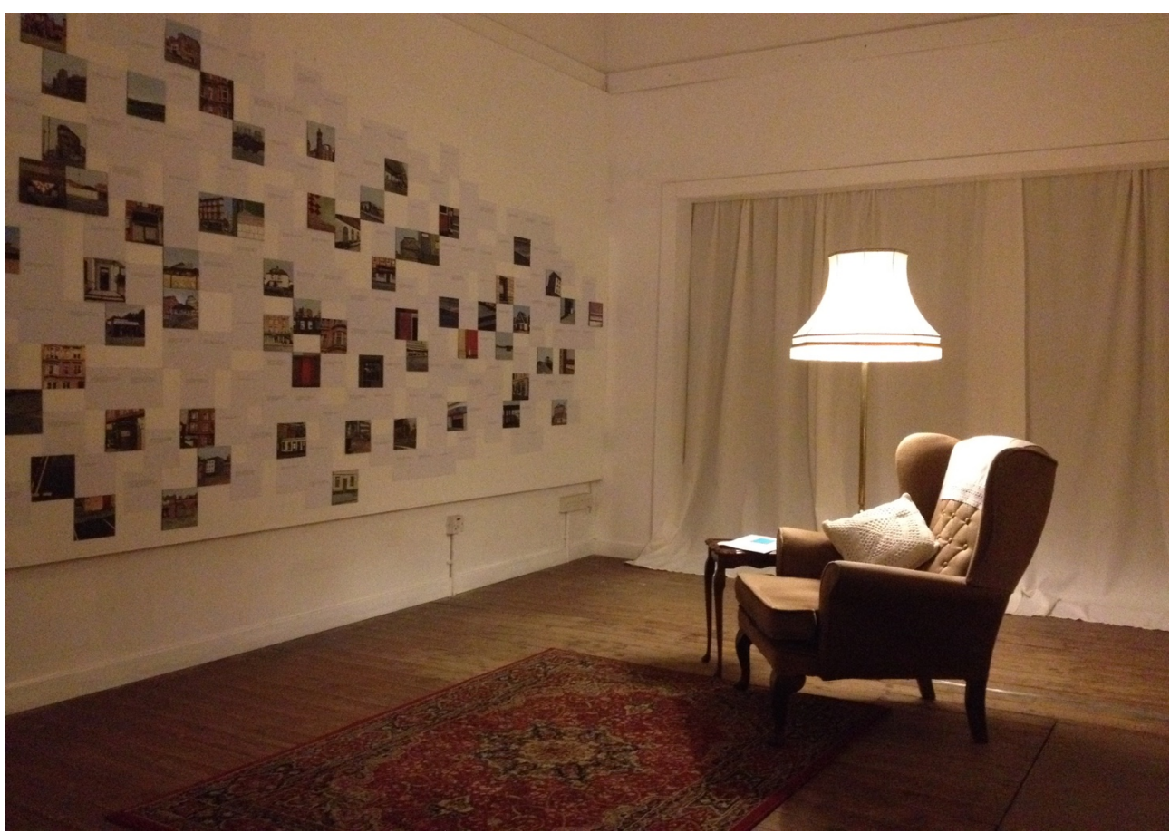
Graham Lister: Installation View, My Altermodern Everyday: Glasgow, 2014.