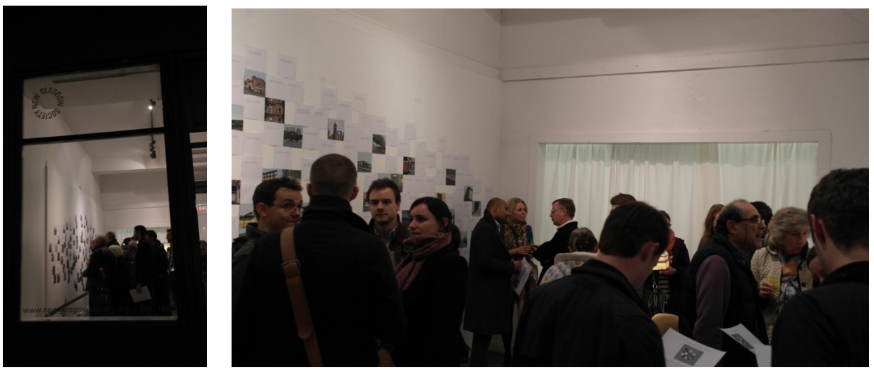
Private View Images, October 2014.

The process of creating this body of work involved refining the act of painting outdoors with oil paint and medium. Photographic works were commissioned and exhibited as part of the overall exhibition. These photographs showed the practice of painting en plein air , both physically and virtually, since for half of the images this activity took place whilst being 'present' in the virtual space of the network.