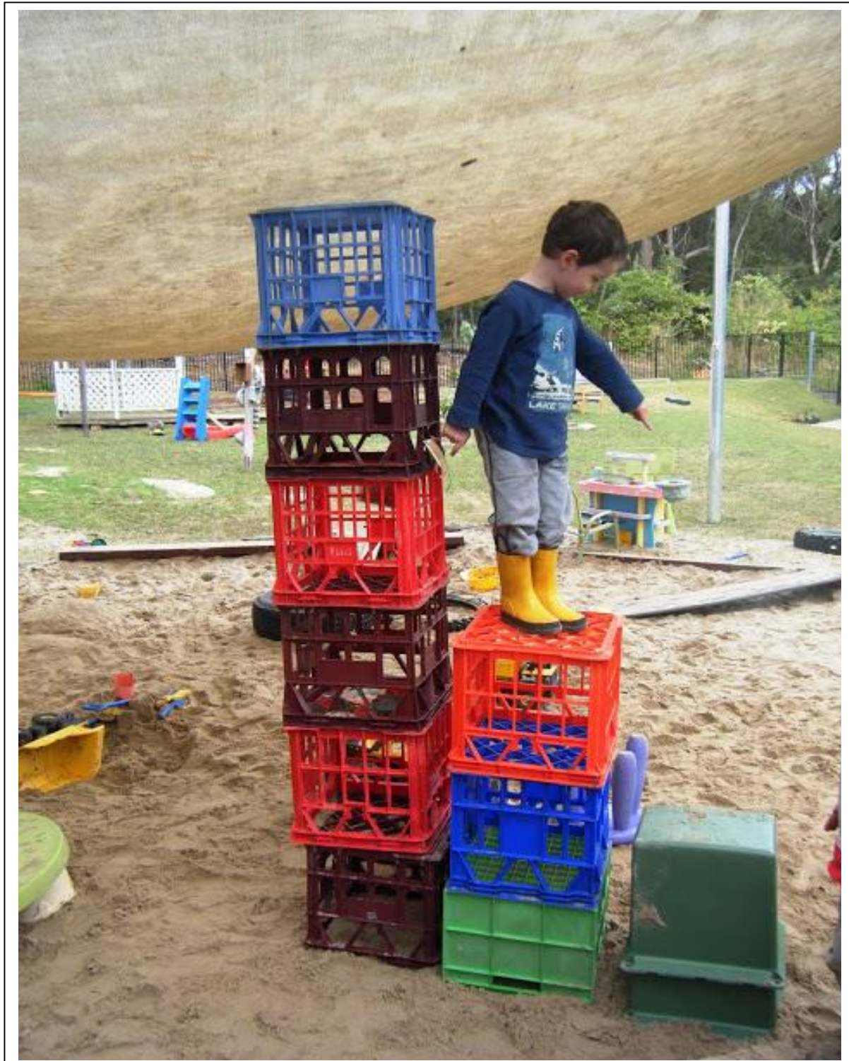
Image 1 - Kable (2010). When they are justifiably proud of themselves for reaching the top