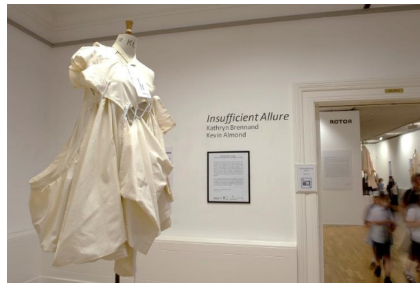
Fig 6. Insufficient Allure (2012) exhibition by Kevin Almond and Kathryn Brennand.

Other groups to draw on the ROTOЯ experience have included local performance dance groups, which have incorporated exhibitions into their performances. ROTOЯ also collaborated with Kirklees Library to disseminate exhibition content, leading to new book purchases and increased lending. Kirklees Library assistants reported a 50% rise in borrowing for the books selected for the ROTOЯ reading group, including some that were rarely borrowed previously, noting, “[ROTOЯ] has been very positive [...] It brings the University into a different space.”