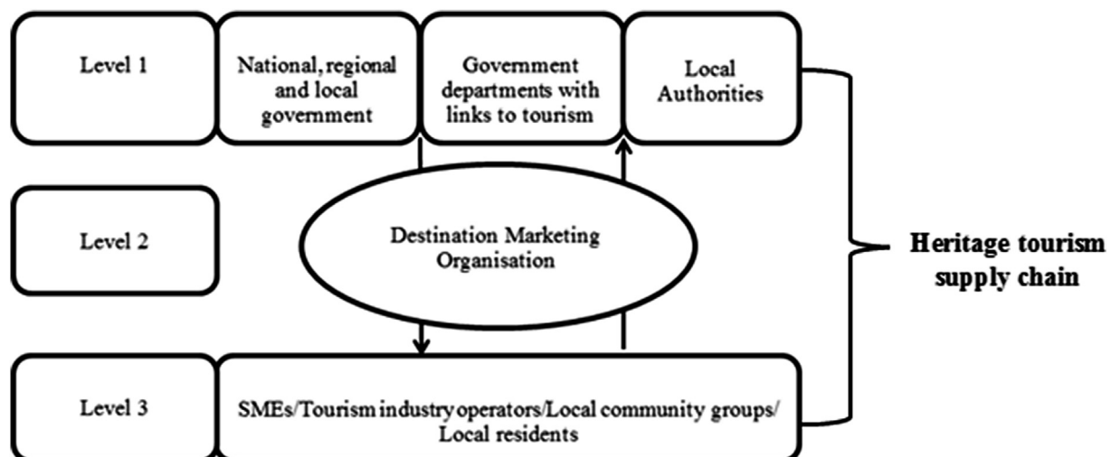
Fig. 1. Heritage tourism supply chain.

The HTSC can be viewed as a hierarchy of three levels of management, as depicted in Fig. 1. Public sector bodies exist at Level 1, and are tasked with a range of responsibilities including providing strategic direction (Kerr, 2003; Vernon et al., 2005; Wray & Cox, 2011), a range of facilities, and executing strategic marketing functions, including destination level promotion and product development (Greenley & Matcham, 1983; Korzay & Alvarez, 2011; Vernon et al., 2005). Tourism products and services are delivered largely by private sector businesses (Komppula, 2014) operating at Level 3, within the strategic framework set out by public sector bodies. These businesses provide the elements of operational visitor servicing required (Gilmore et al., 2007; Greenley & Matcham, 1983) and need to be interdependent and complementary (Komppula, 2014). The firms operating at Level 3 must operate in conjunction with the public sector in order to provide a viable, holistic and streamlined service product (Bornhorst et al., 2010). Operating between these two levels is the quasi-public/private sector level, Destination Marketing Organisations (DMO), that create a link between Level 1 and Level 3 and are recognised as