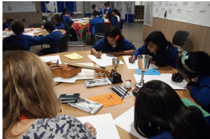
The Big Draw