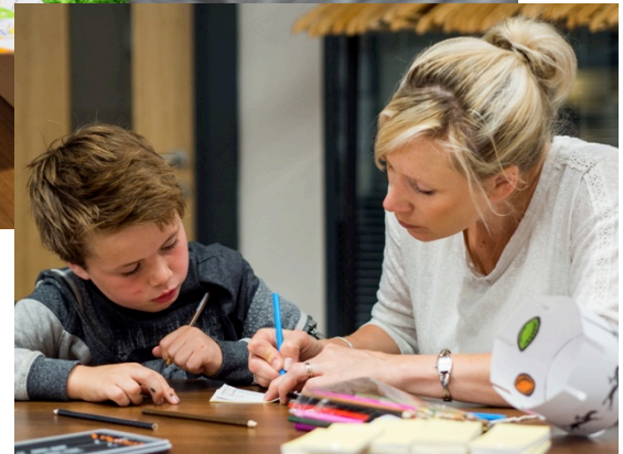
Chol Theatre 'Play in a Week'