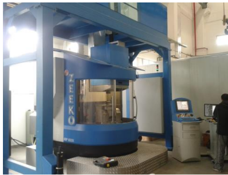
Figure 1. CNC polishing machine integrated with optical test tower for on-machine interferometry

In the case of standard optical shop practice, large optics are often left on the CNC polishing machine turntable for the entire process/metrology sequences. The machine is then typically located under an optical test tower for full-aperture interferometric metrology. An example of this is shown in Figure 1, where fringe-finding has been automated (Figure 2) by feeding back the phase-maps from a 4D Technologies simultaneous phase interferometer on the test tower, to an automated motion stage incorporated in the test tower. Smaller specialized metrology instrumentation (e.g. for texture, sub-aperture interferometry etc) may also be deployed on the machine, or positioned directly on the surface of the part.