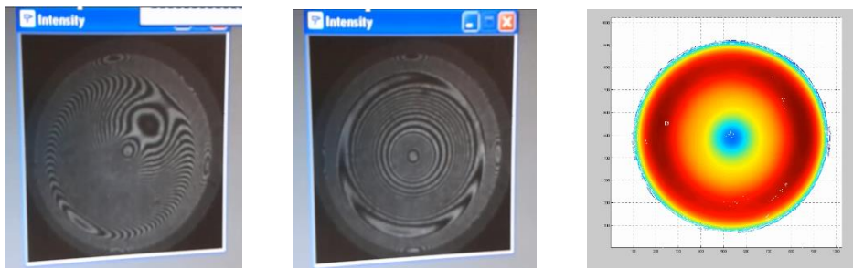
Figure 4. Screen shots of Fisba fringes before and after auto-nulling, and the resulting phase map

The next stage in this development will be to install an automated wash-down facility, to be performed by the robot arm. This will enable the loop Step 8 => Step 1 to be completed