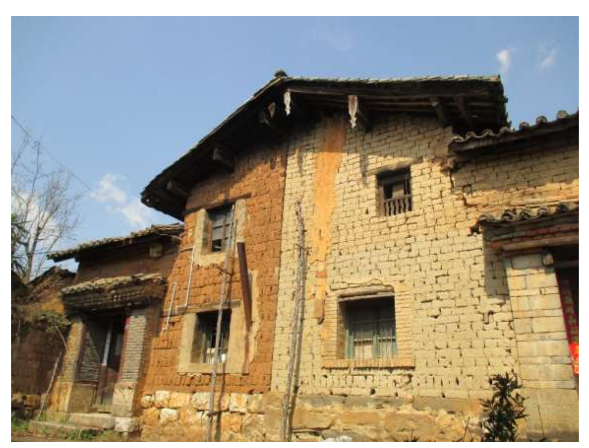
Figure 3. Damoyu traditional construction dwelling.

Analysis of the traditional buildings shows internal layouts to have the majority of windows and openings facing in one orientation. The majority face to the east given the slope of the land and towards the main surfaced roads through the village. Many of the new dwellings face from the other side of the road towards the west and have rather more windows. The use of modern materials of concrete and bricks seems to have promoted the adoption of large glazed openings in a number of cases, also clearly seen in Figure 4. From the on-site survey of both new and old dwelling construction, it appears that improvements to performance might be found relatively easily if more attention were focused on window positioning, size and function, taking account of exterior features and the internal space needs.