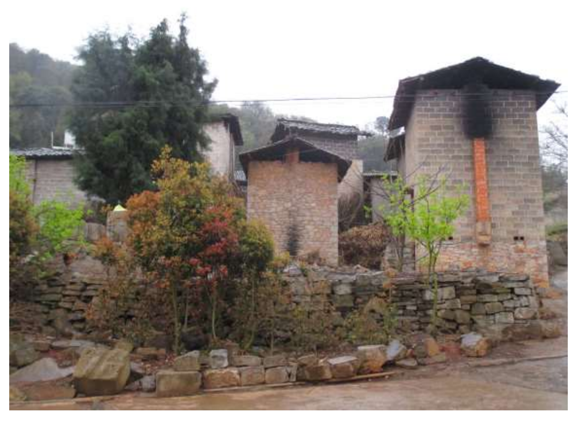
Figure 11. Nuohei tobacco drying towers.