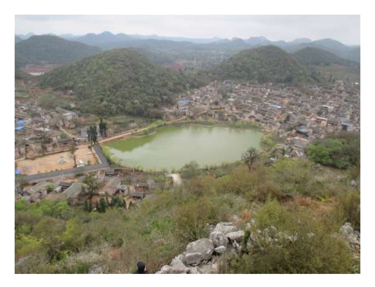
Figure 9. Nuohei: view of the village.

The village is prosperous with places to eat and buy products, as well as places to stay, each of which are advertised on the posters in the main car parking area and on numerous signs through the village in both Chinese and English. There is a propensity of motorized transport (though many vehicles are those designed for agricultural purposes), and there is a thriving village school. The village emphasizes traditional development focusing on preservation; it follows strict guidelines for the protection and management of intangible cultural heritage and of the environment. It was declared a region for the protection of the Sani Yi culture by the state in 2006.