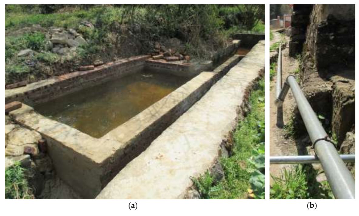
Figure 5. Damoyu water systems: (a) agricultural irrigation tank; (b) domestic water supply pipe.