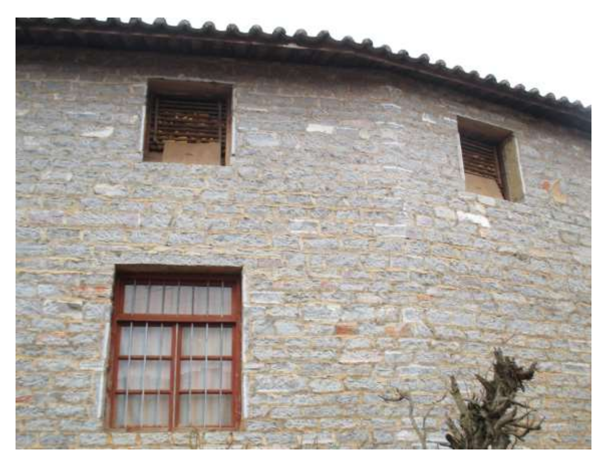
Figure 12. Nuohei maize storage on upper floors.

Turning to the buildings themselves, in contrast to the traditional adobe buildings of Damoyu, they are constructed from stone set in many different patterns. Figure 13 shows a collage of styles, including both stones and bricks, which can be seen walking along the main street of the village. The majority of buildings are in a good state of repair, though it is also clear that some maintenance is required in a number of cases. Many buildings also make use of timber and other materials, as well as, of course, glazing. There is no clear evidence of the use of modern insulation materials. Those buildings constructed using similar adobe materials to those of Damoyu seem to be in a poorer state of repair than those constructed from stone. There also seems to be an increasing use of concrete blocks for construction, particularly for the agricultural buildings.