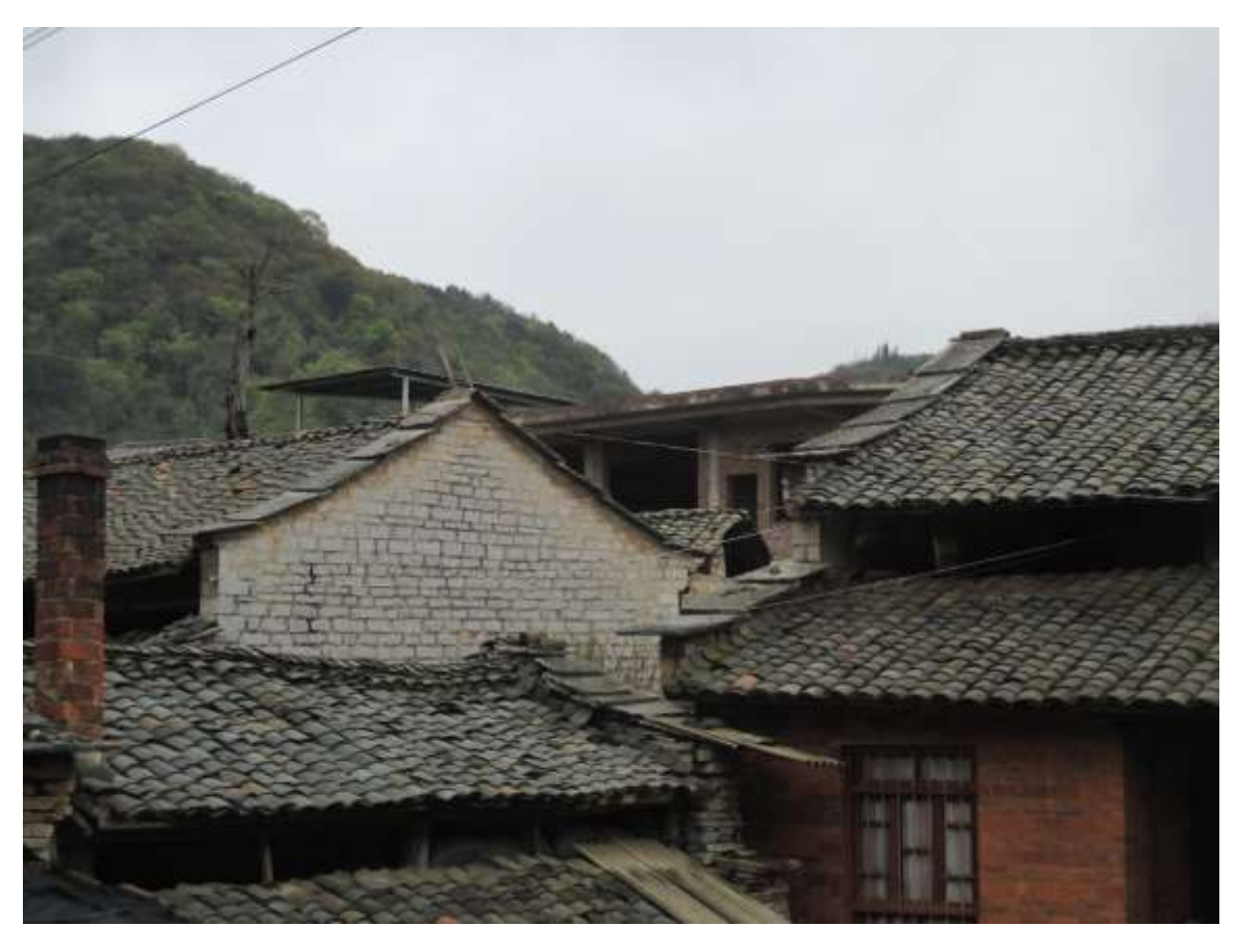
Figure 10. Nuohei traditional stone dwellings.