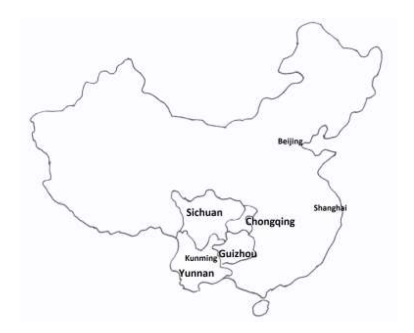
Figure 1. Map of China showing the provinces of interest, including Yunnan.

The focus area for the larger research study of which this paper reports a part is southwest China, the provinces of Yunnan, Guizhou and Sichuan. Also associated is the city of Chongqing and its environs (which is currently one of China's four centrally-controlled municipalities, but which was formerly part of Sichuan). The outline of the location is shown in Figure 1.