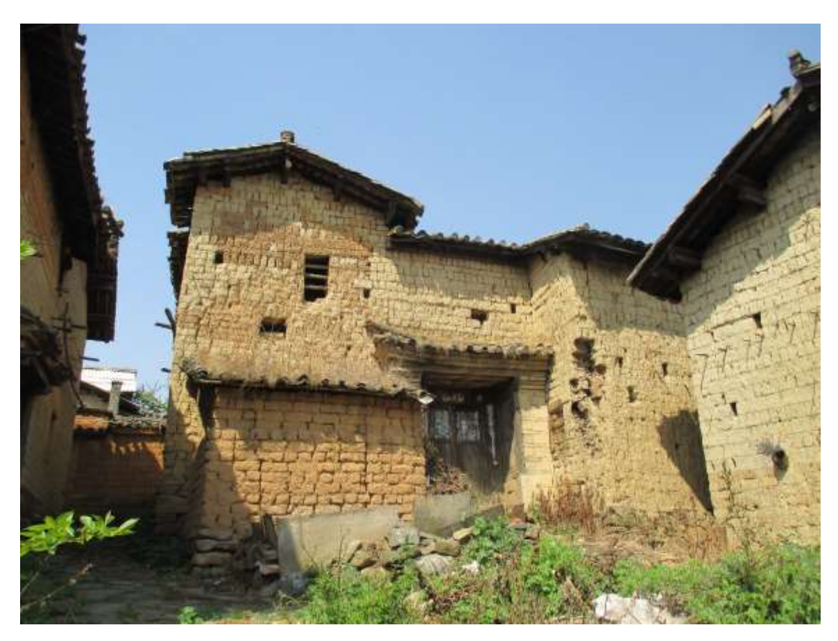
Figure 7. Damoyu deteriorating building.