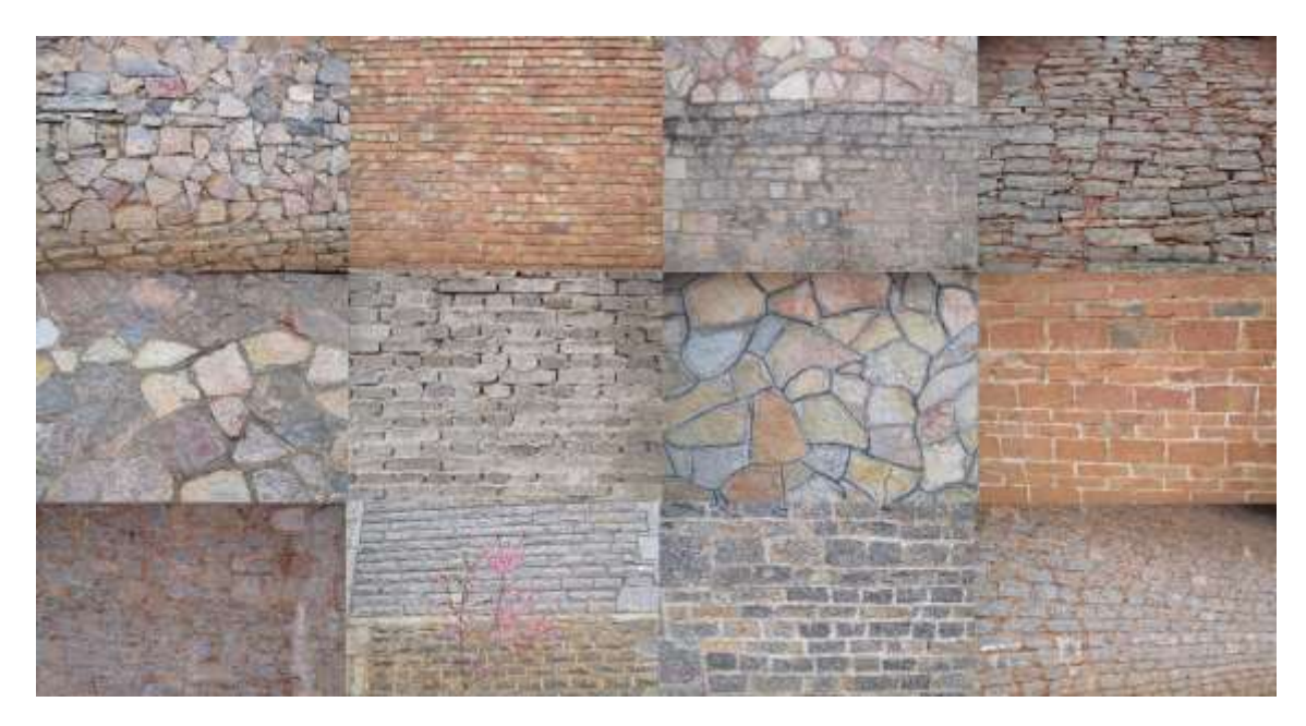
Figure 13. Nuohei: collage of twelve different wall constructions.