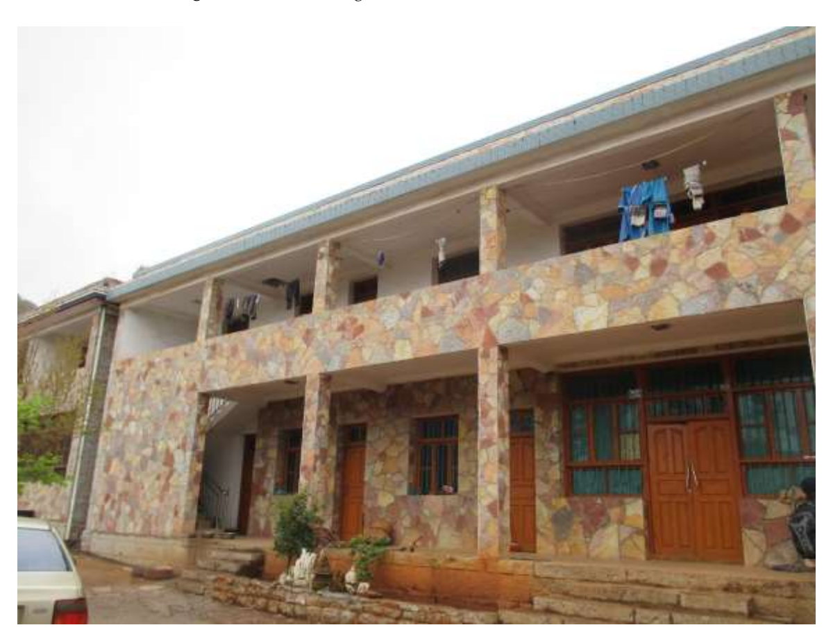
Figure 14. Nuohei modern building.