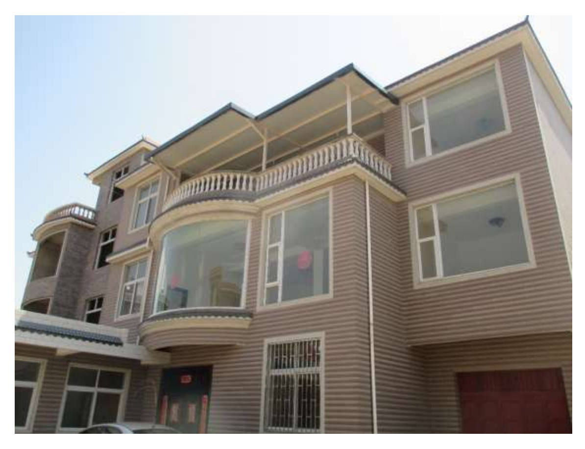
Figure 4. Damoyu new construction dwelling.