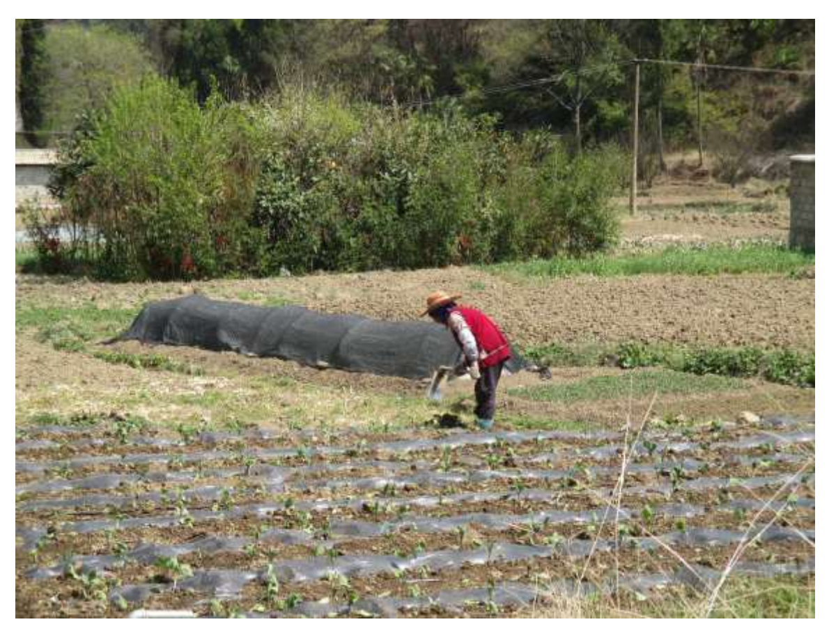
Figure 6. Damoyu older resident working the agricultural land.