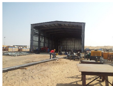
Figure 2: Pipe Spool Prefabrication Workshop

Neither systematic visual pull-control nor visual levelling efforts were found on the site and within the studied subcontractor. The manager and site supervisor had not heard of the kanban or heijunka system. One visual pull-control and production levelling opportunity was identified at the pipe-spool fabrication unit of the studied subcontractor. For a quick and high-quality erection, heavy pipe-spools (straight pipe sections, elbows, reductions, valves etc.) with different pipe/fitting diameters and configurations had been pre-fabricated (assembled together) mostly through welding operations. The prefabrication was managed and prioritised in a linear manner by the CPM based schedule of the piping works. This pipe prefabrication practice is not very different in essence from producing on-site concrete batches in which visual production levelling through kanban and heijunka has been successfully implemented in various building construction projects in Brazil (Tezel et al., 2010). Using the kanban and heijunka systems in such a setting for pipe-spool prefabrication remains as a noted VM research opportunity; yet the implementation requires a sufficient level of awareness from the management. See Figure 2.