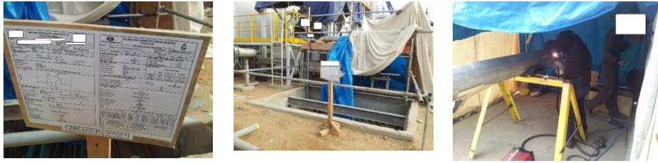
Figure 8: Mobile WPS Signs and Integrated Visual Aids