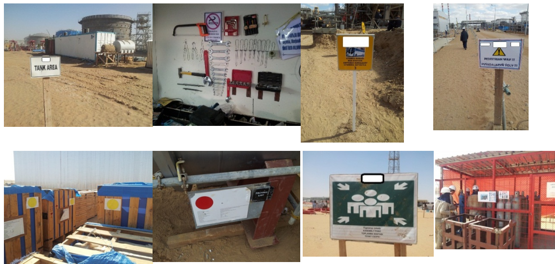
Figure 1: Standardisation of Workplace Elements: Example Applications