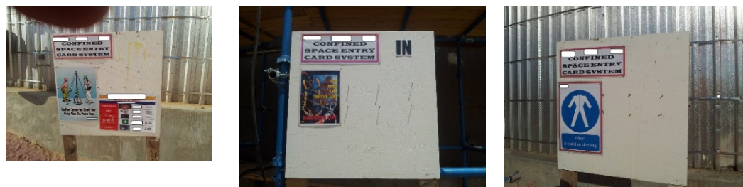
Figure 6: The Confined Space Tracking Boards

The subcontractor had adopted some boards to track the personnel working in confined spaces, particularly in tanks and manholes. The hazardous inert gases generated by welding and some installation activities in confined spaces are fatal. Therefore, human presence under those conditions is often constrained. The personnel intending to work in a confined space would hang its ID card on a board near the confined space and their entrance to the work area would be recorded. At a glance, who has been working since when in a tank or another confined space could be identified from the board. See Figure 6.