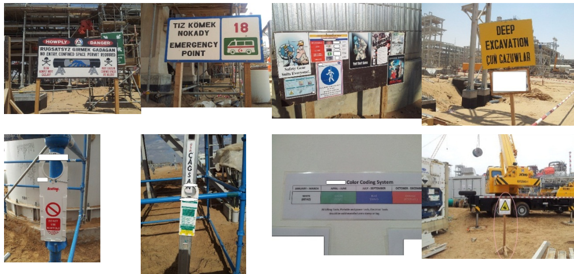
Figure 5: Some Visual HSE Practices on Site

The main contractor's and consequently the subcontractor's strongest emphasis were on health and safety (HSE) issues. The main contractor had strictly imposed their general practices on the subcontractors. Static and mobile safety signs, visual reminders, a colour-coded equipment checking system (every month a colour would be picked to identify the safety checked equipment), scaffolding safety tags (a colour-coded tag that determines if a scaffolding is safe to use or not), wind roses against gas leakages, safety barriers, posters etc. were all over the construction site. See Figure 5. Poka-Yoke systems incorporated into the cranes that lock the crane booms under certain environmental temperatures and above certain wind speeds were also in use.