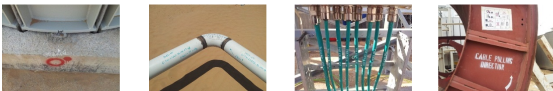
Figure 4: Improvisational Visual Management and Integrated Visual Aids

Spontaneous integration of information into the environment as self-visual aids/reminders was a common practice among the mechanical erection, welding, pipe fitting, electrical installation and instrumentation crews. Writing the isometric drawing line number or the welding method/welder name on a steel pipe, marking the circular orientation on the foundation of a drum vessel, integrating the cable schedule information on a group of cables or displaying the location of a specific electrical junction box on a steel column were very common examples that one could easily come across with on the site. Those information needs could be captured by the management and material vendors in order to improve the information flow for the production crews. Some visual aids integrated on the materials/material containers were also identified. See Figure 4.