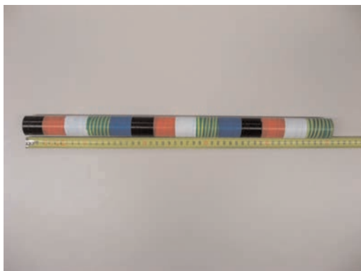
FIGURE 2.1 The novel object.

The touch test was also carried out at the three locations in the house. The observer gently sat down. From the birds that were in reach of the observer, the observer tried to touch a maximum of 12 birds. If less than 12 birds could be touched, a maximum of 12 trials per location was carried out. The ratio between the number of birds touched and the number of birds in reach (for all locations) was calculated. The avoidance distance test was