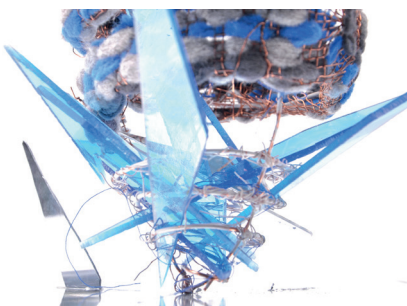
Difference & Repetition