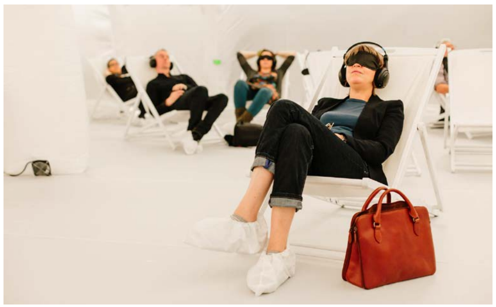
A Borderlands Audience.