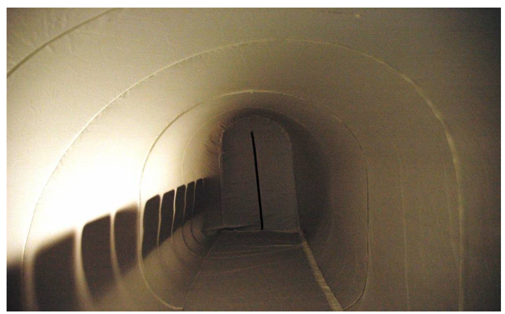
The Totum One Entrance Tunnel.