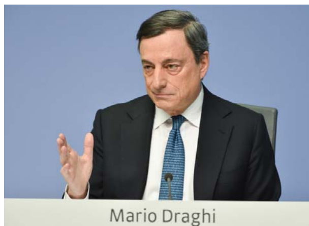
Trigger happy president?

Draghi also announced another round of quantitative easing – the introduction of new money into the economy. It is the eleventh attempt to reignite money supply growth since he took the helm and will increase the current injection of €60 billion a month to €80 billion each month.