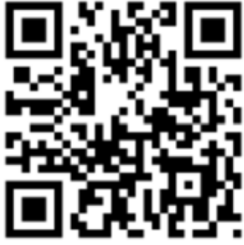
A QR code, containing the link for Wikipedia.

information, soon supply chains and consumers will demand more, and a successor will be required.