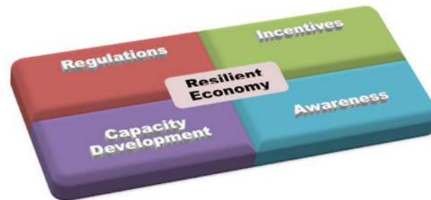
Figure 1: Key pillars to promote resilient economy

with multiple partners to prioritize resilience in land use planning and design; and ensuring investment are resilient to impacts of extreme climactic events and new risks presented by rapid urbanization, such as stress to eco-system services and natural resources. The key pillars to promote resilient economy (Figure 1) requires risk informed decision and building capacities of private sector