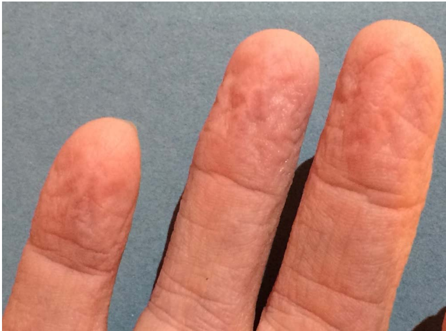
Figure 1 Transient, hyper-hydration of the skin (wrinkling) following prolonged immersion in water. This is quickly reversed on exposure to air