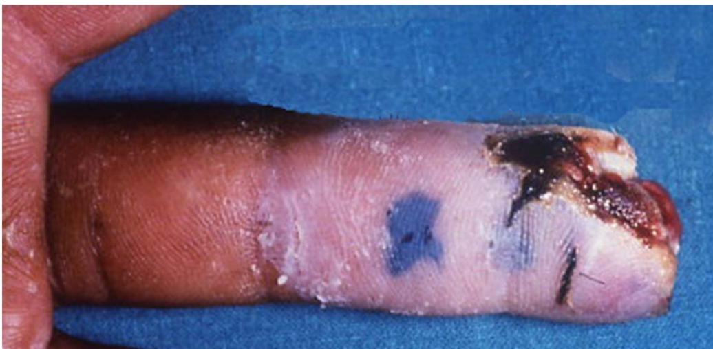
Figure 2 Maceration of a finger as a result of inhibition of TEWL. This is promptly reversed on removal of occlusion.