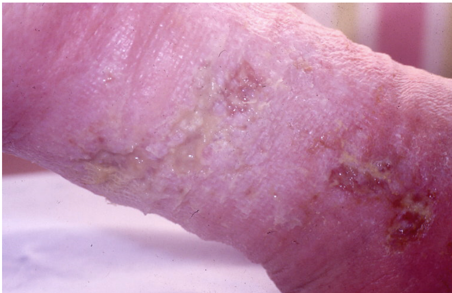
Figure 4 Grossly macerated peri-ulcer skin as a result of the combination of chronic wound exudate containing proteases and prolonged intervals between dressing change

with whitened skin, swelling and where the surface of the skin is laced with multiple networks of fine grooves called sulci cutis