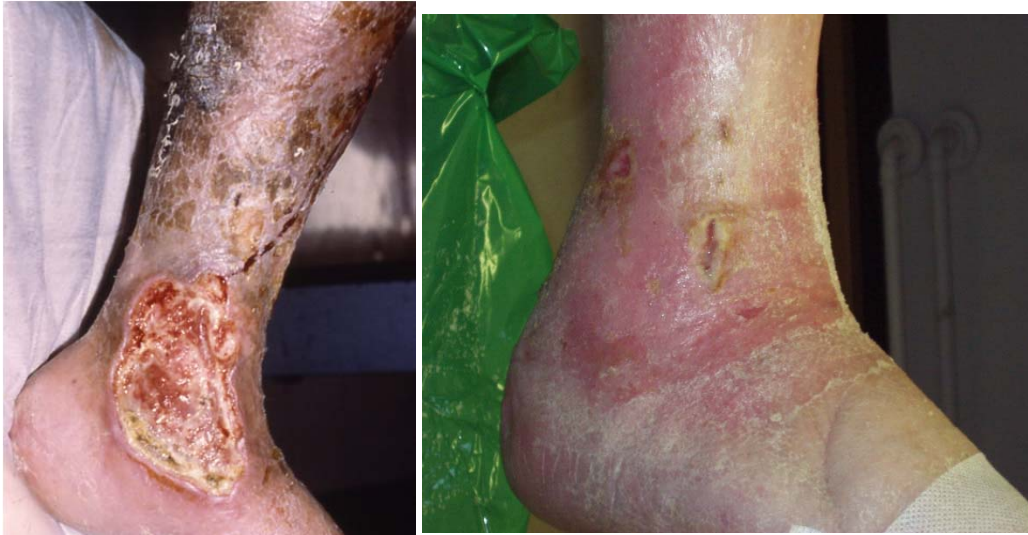
Figures 5 & Figure 6 Maceration of venous leg ulcers with associated dermatitis/venous eczema