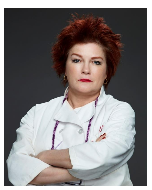
Fig, 6. Galina "Red" Reznikov (Kate Mulgrew)

If Morello can be regarded as a character who has fallen victim to the beauty myth, one character who visibly subverts it is Red. Not only does Red specialise in acquiring cosmetics for the women in Litchfield, but she also participates in using the products herself.