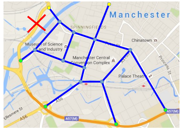
Figure 4: The considered scenario B. It represents a section of the Manchester urban area. Modelled roads are shown in blue. Part of the ring road (crossed out) is blocked. Incoming traffic flows enter the network from entry points (green) and have to reach exit points (yellow).

The second network is shown in Figure 4. It represents a large section of the Manchester (UK) urban area. Specifically, it simulates what happened in August 2015, when a section of the ring road had to be closed because of a large hole due to heavy rainfall. 1 As a consequence, the traffic that usually flows through the ring road has to pass through part of the city centre, which is already saturated by the usual passing-through traffic. This network has been selected in order to check the scalability of the proposed approach on