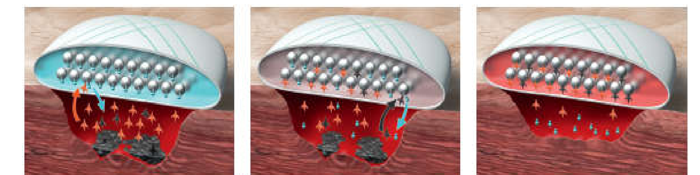
Figure 3: schematic of dressing action

Optimising the hydration/moisture balance of the wound optimises healing. Both moist and wet wound healing offers significant healing benefits compared with dry wound healing. The clinical experience of excessive wound hydration being damaging to tissue and the studies suggesting that wet wounds heal with similar benefits previously ascribed to moist healing seem, at first glance, to be contradictory. However, this information, together with the knowledge that chronic wound exudates are fundamentally different from acute wounds, offers an explanation for the apparent contradiction. Chronic wound exudates contain high levels of protein-degrading enzymes and other tissue-damaging components that are able to damage tissues 6 . Acute wounds, however, contain low and controllable levels of these components that are little able to act on tissues. Chronic wound exudates damage tissues because of these components and not as result of exposure to the water itself..