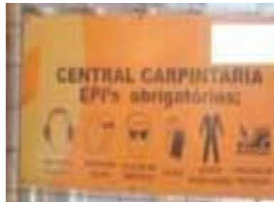
Figure 3: Example of Analysed Case (No. 157) (after Tezel et al., 2010)