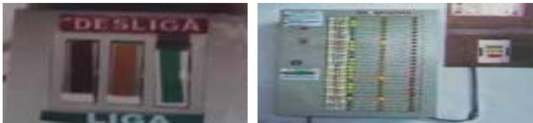
Figure 2: Example of Analysed Case (No. 86) (after Tezel et al., 2010)