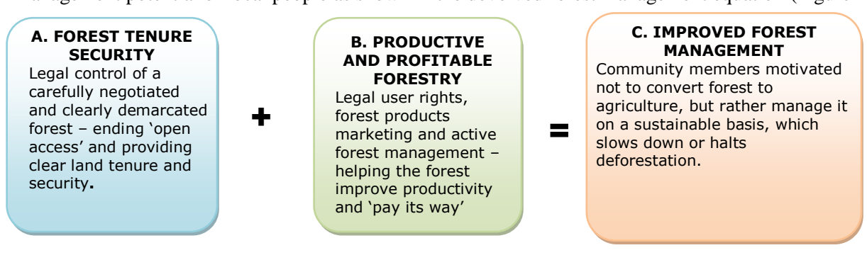
Figure 1. The principles under which PFM operates to ensure improved forest management outcomes

The most important incentives for communities to invest in sustainable forest management through PFM are tenure and user rights. Getting these key incentives in place and strong enough is the key to realise the forest management potential of local people as shown in the devolved forest management equation (Figure 1).