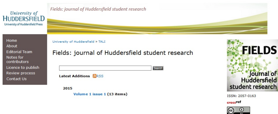
Figure 2. Fields: journal of Huddersfield student research 59

The University of Huddersfield Press was re-launched in 2010 as a predominantly open access publisher to provide an outlet for peer reviewed publications for University authors, to encourage new and aspiring authors to publish in their areas of subject expertise and to raise the profile of the University through the Press publications. Caprio 57 cites the rise of Institutional Repositories (IRs) and the emergence of library publishing services as an opportunity for collaboration between the library and faculty in publishing student research journals. The Press publishes a number of peer reviewed journals via the HOAP (Huddersfield Open Access Publishing) platform using Eprints software to create bespoke journal landing pages. This was the result of Jisc project funding 58 and this made it an excellent fit for the aims of Fields (see figure 2).