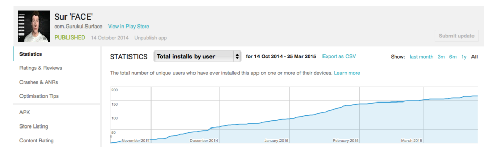
Fig. 6. Statistics showing total user installs of Sur-Face in a month wise manner.

Google Play store and iTunes Store distributes the apps developed for Android and iOS platforms respectively (24). A developer account was created before exporting Sur-Face app into the app store. Once the upload was done, the cost was set to free and in 24 hours, it was made available for download. The app was downloaded 167 times till date with most number of downloads from Brazil followed by Russia and United Kingdom. Figure 6 shows the statistics of total installs by users in a month wise manner as represented in Android developer portal.