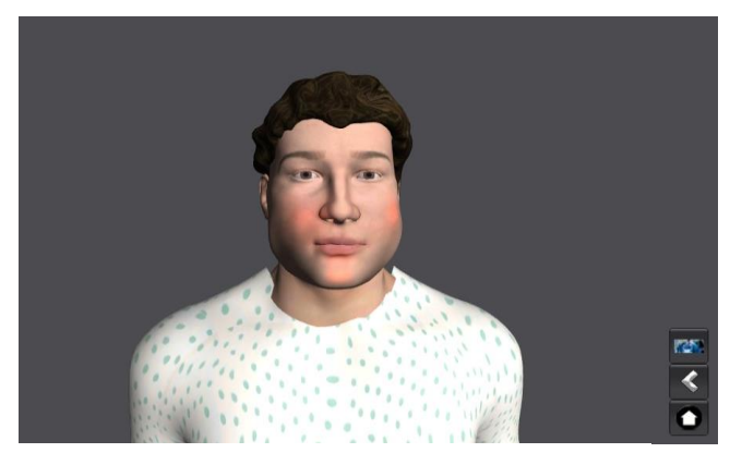
Fig. 5. Swelling after the surgery

knowledge of complications that are involved. To further explain the surgery, verbal instructions without scientific jargon were recorded using Avid Pro tools (21) and Apple Garage Band.