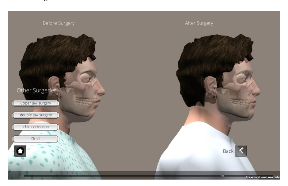
Fig. 3. Slider to show changes in face before and after surgery

In the design of surgical procedures, five surgeries namely, the upper jaw surgery, lower jaw surgery, double jaw surgery, chin surgery and bone graft from hip were represented. This section contains interactive 3D animations that demonstrate bone cuts, movements and final rigid fixation. Patients can also visualize the pre and postsurgical variations for each procedure with the help of a slider interactively as shown in the Fig.3.