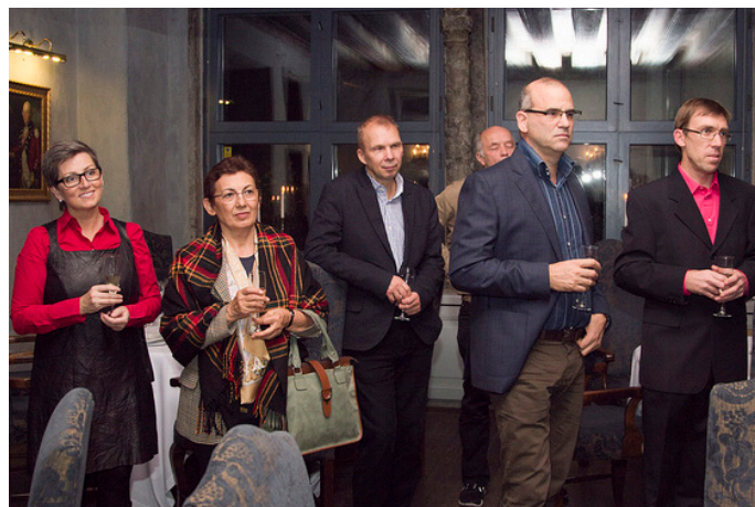
ABOVE: The annual ANDROID network conference was held in Tallinn, Estonia and the first opportunity for all partners to meet and discuss the network's ambitious workplan