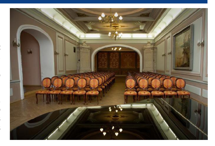
ABOVE: The first annual ANDROID network conference will be held at the historic Teachers' House (Õpetajate Maja) in Tallinn, Estonia

For the latest information about the conference, including a detailed programme, please visit the conference webpage at: http://www.disaster-resilience.net/index.php/news/2012-android-conference