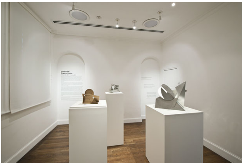
Figure 6. Henry Moore Institute. Lygia Clark: Organic Planes , Exhibition 24 September 2014–4 January 2015.

physically experienced, such as heaviness and lightness, fullness and emptiness, warmth and cold, light and dark. 42