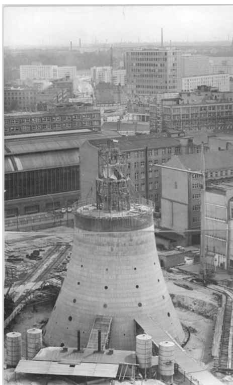
Figure 4. [Image of the construction of the Berlin Transmission Tower – General German News Service (GDR)], 23 June 1966 (Bild 183-E0623-009-001).