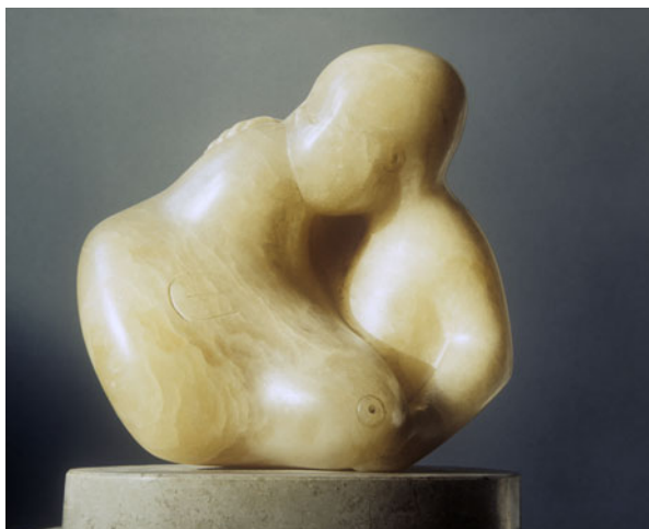
Figure 2. Henry Moore, Suckling Child , 1930 (LH96 Alabaster).

Suckling Child shortly after ‘had a strange afterlife as a virtual reincarnation’ in the alabaster carving in Epstein’s possession. 16 The transmigration of a concrete memory into alabaster is not without significance, nor is Epstein’s role in this process. For Wagner, Moore’s reworking of Suckling Child through the use of another material, is also a transformation which puts the meaning of the former concrete version under some kind of erasure, and this, she argues, is part of Moore’s retreat from the ‘maternal sign’ to ‘the public economy of male identity, at least in its high modernist form’. 17