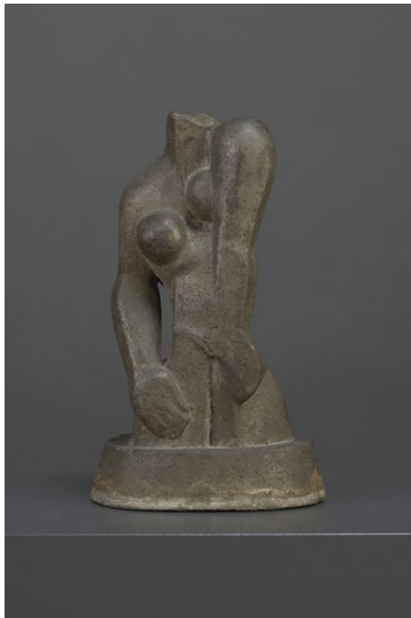
Figure 1. Henry Moore, Torso , 1926 (LH37). Cast Concrete.

In 2012, the Henry Moore Foundation acquired Torso , an early 1926 concrete carving of Moore’s (Figure 1). Only 21.6 centimetres high, Torso is one of a series of ‘technical’ experiments Moore undertook between 1926 and 1934. These early experimentations in concrete test the limits of new materials alongside more established methods and practices of sculptural production. Featured in the Moore