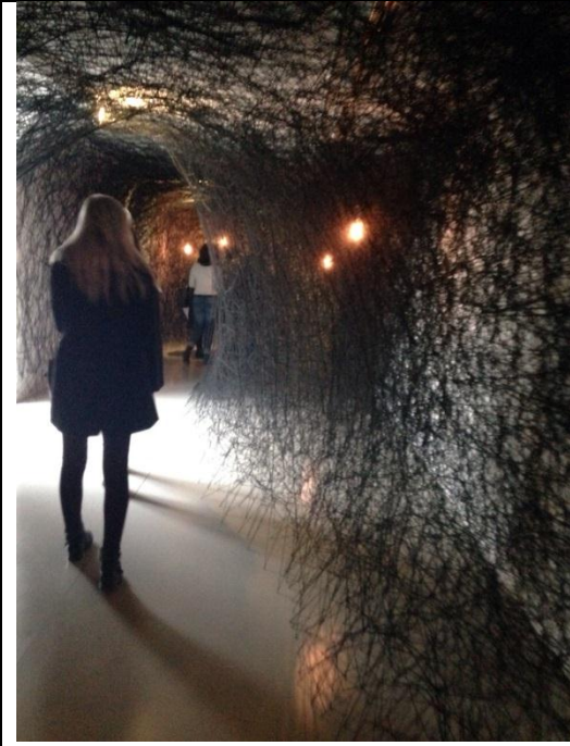
Image 3: Infinity by Chiharu Shiota, Espace Louis Vuitton, Paris