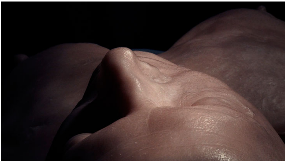
Figure 8. Christine Borland, SimWoman , 2010, Film Still, 12minute 30 second loop, H.D. Video, projected.

B: I feel a certain relief as well and it's been built into the decision-making that I'm not actually physically representing the spectacle of the sculpture as part of the show, in its raw, broken and undignified form – there's plenty of that conveyed in this mediated