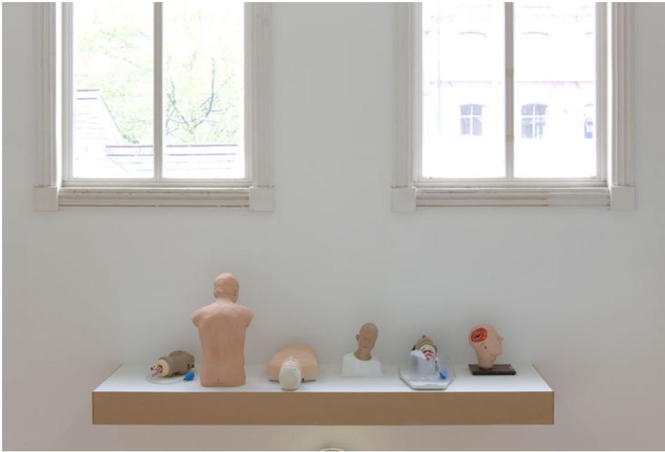
Figure 3. Christine Borland, SimBodies & Nobodies , 2009, Detail, Medical Manikins.