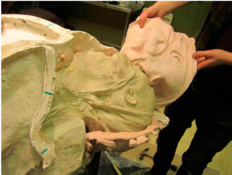
Figure 5. Christine Borland, Cast From Nature , Glasgow Sculpture Studios, 2010, Casting in Progress.