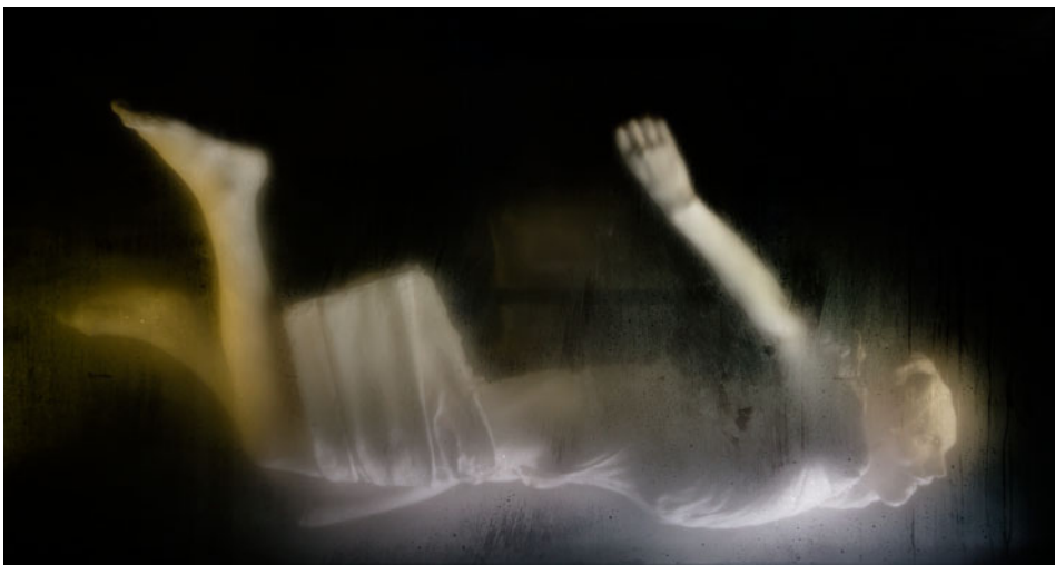
Figure 2. Christine Borland, Film Still – NoBodies; Cast From Nature , 2011, 12minute 30 second loop, H.D. Video, projected. (Made possible by The Morton Award for lens based media, 2010)

From the beginning of the Glasgow Sculpture Studios exhibition (late 2010) to the exhibition at Camden Arts Centre in May 2011 Borland seemed perplexed by her fascination with the plaster cast and sought to apply this in exhibition arrangements