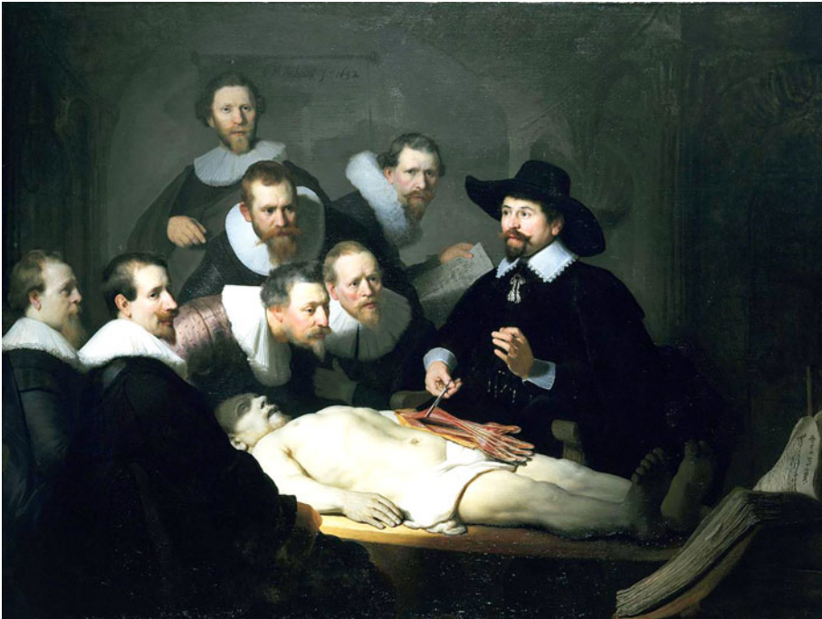
Figure 1. Rembrandt van Rijn, The Anatomy Lesson of Dr. Nicolaes Tulp , 1632, (detail). Collection of Royal Picture Gallery Mauritshuis, The Hague.