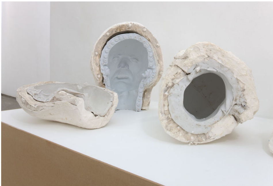
Figure 4. Christine Borland, SimBodies & NoBodies , 2009, Detail Plaster & Silicon Moulds.