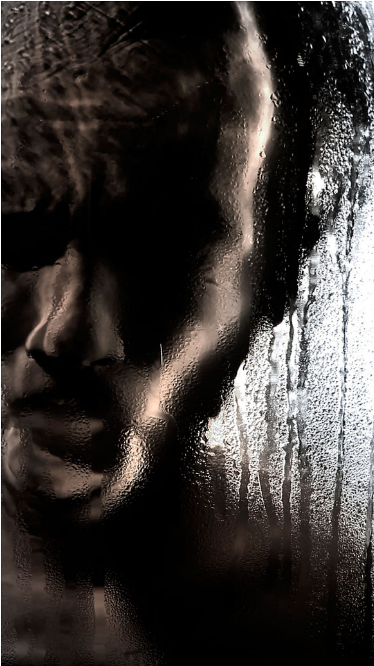
Figure 9. Christine Borland, NoBodies , (Detail) Choking Charlie , 2009, Film Still, 10 minute loop, monitor.