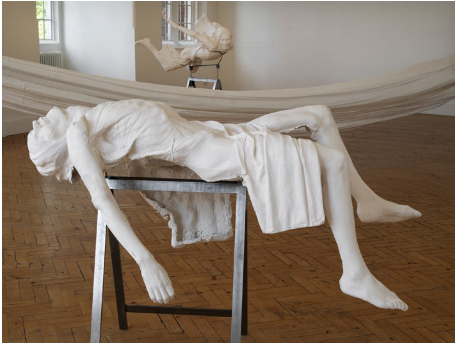
Figure 6. Christine Borland, Cast From Nature , 2011, Camden Arts Centre.

looked to the heavens but stared ahead with a languid but superior menace. Two figures, one classically reposed after death in contrast with the other, caught in the fast race towards death set in a room with an almost imperceptible even settling of fine chalk dust. Plaster is heavier than other dust motes.