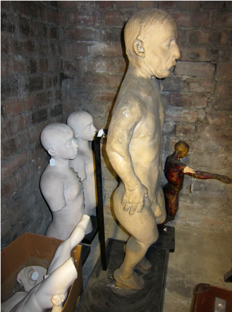
Figure 7. Basement, Edinburgh Anatomical Museum Stores.

Richardson: With nothing catalogued and no proper documentation, how did you set about finding this lost plaster cast?