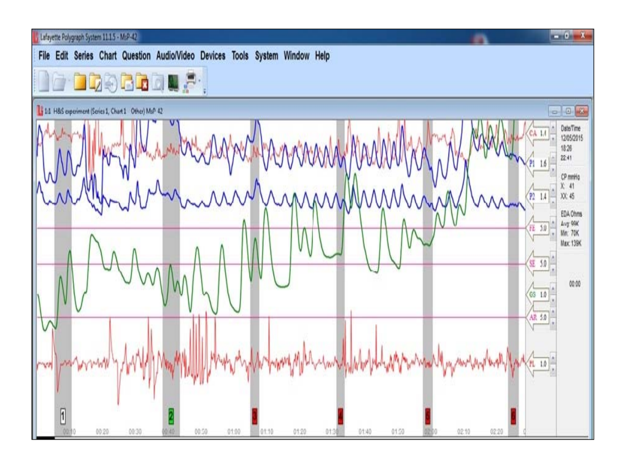
Figure 1: Digital polygraph output.<sup>3</sup>

The physiological channels that the polygraph measures have remained largely unchanged from Keeler's original models (Buckley, 1980). They are cardiovascular activity (Red line, figure 1), respiratory activity (Blue line, figure 1) and electrodermal activity (Green line, figure 1) which is also known as Galvanic Skin Response, (GSR). Increases in heart rate and blood pressure are brought on by the sympathetic nervous system releasing the postganglionic neurotransmitter norepinephrine, while a decrease in heart rate and blood pressure is brought on by the parasympathetic nervous system releasing postganglionic acetylcholine. Pressure-sensitive receptors, Baroreceptors, play a central role in activating the appropriate system when blood-pressure suddenly drops or rises, thus maintaining the basal