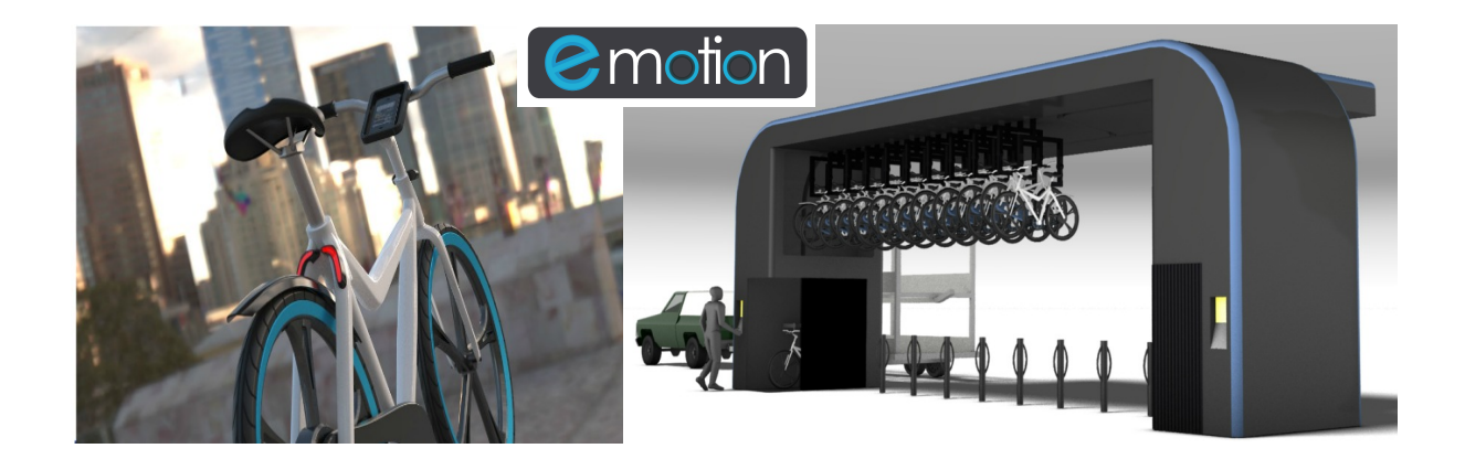
Figure.3 E-motion Bike-Sharing System (Designed by Andersson, Engelshove, Epp, Knutsson & Li)

E-motion is a design solution that its main focus lies on maximizing the benefits of bike-sharing in Gothenburg in terms of both exploration and user experience. It is hypothetically linked with BMW brand values. The asymmetrical design of the vehicle, the use of an electric motor that together with a pedal assist sensor, provide comfort to wider (not particularly athletic) audiences and the intelligent technology touches, such as the GPS/Smartphone holder that allows on-board charging from the vehicle's battery resource, are the details that differentiate e-motion. The larger-than life bike stations that provide visibility of the scheme and automated bike off the ground storage are two very bold design ideas that mean to make the system overall an attraction for the city's transport. Free two-hour travel cards are proposed to attract first-time users, while e-motion will heavily invest on integration with other modes of public transport by becoming part of the Västtrafik card package.