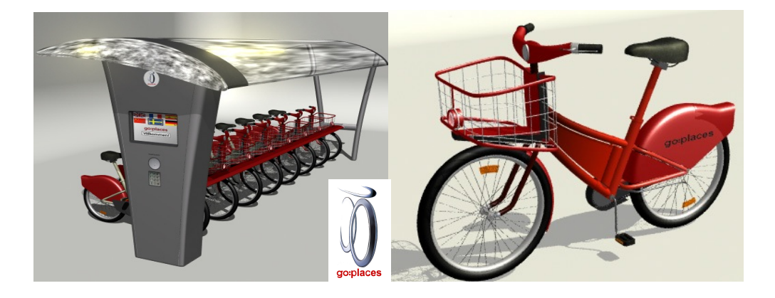
Figure.4 Go:places Bike-Sharing System (Designed by Emfors, Lindahl, Mårdsjö & Rolfö)

the same time are built with durable materials and anti-vandalism principles. Information is provided in six different languages, while four subscription options namely: annual, monthly, 3-day and 10-hour are offered.