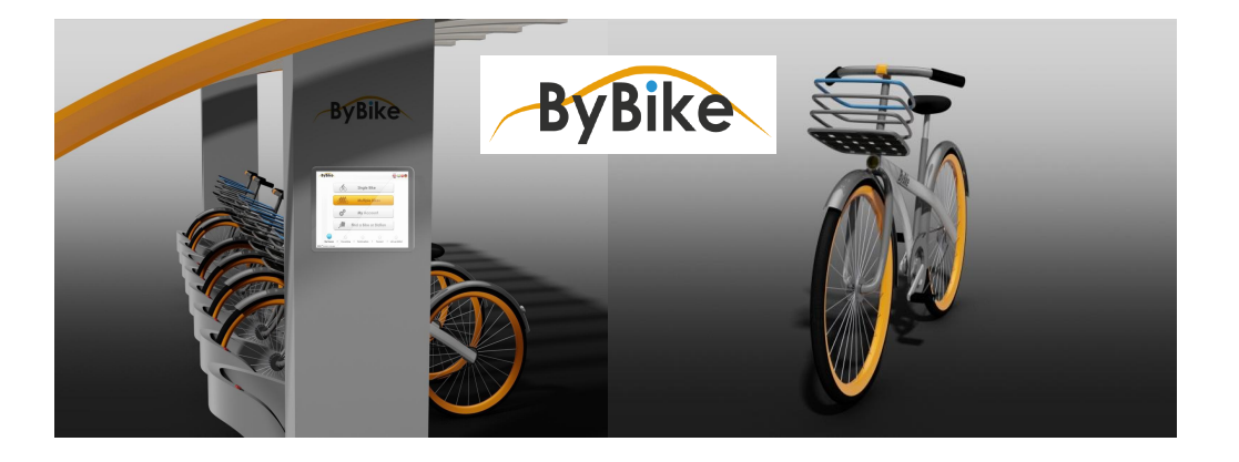
Figure.1 ByBike Bike-Sharing System (Designed by Sörensen, Dong, Fellin, Lejon & Wallsten)

fault button meaning to enable users to dynamically report damaged vehicles, the tires that have a reflective orange surface making bicycle visible from distance and during night and a particularly generous storage basket made partly from reused seat belts are the trademarks of the bicycle design. Bike stations are designed to be roof-protected and recognizable, using the latest technological advancements. ByBike proposes the introduction of two more types of subscription passes on top of the ones already in use; a weekly and a 6-month one.