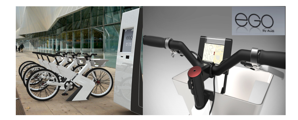
Figure.2 eGO Bike-Sharing System (Designed by Axelsson, Kääpä, Pukala, Olsson & Olsson)

eGO is a fictive eco-brand referring to an innovative electric bike-sharing scheme that means to promote an active lifestyle in European university cities such as Gothenburg. eGo is created by the student group initially linked to Audi and this is why it shares some of the key design philosophy values that are attributed to Audi: such as progressiveness, creativity and commitment. The brand name eGO is built up on two parts: "e" that stands for electricity and "GO" that denotes the status of being on the move. eGO also refers to the word ego meaning to emphasize the personal dimension of using the scheme since cycling as a whole is a way to transport oneself to another location; an individual and autonomous move. This however does not symbolize a self-centred attitude entirely disengaged from pro-social behaviour; on the contrary, using this bike-sharing scheme is a way to make a personal statement about actively doing something for a more sustainable future.