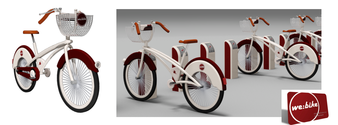
Figure 7 We:bike Bike-Sharing System (Designed by Adams, Capellan, Forsaeus, Jonsson & Joshi)

orange oil. We:bike aims to make the signing up process less challenging; cards will be available almost in every shop in Gothenburg, besides the bike-sharing stations and the online purchasing option. The interface of the terminal touch screen is improved to become more user-friendly and informative. Audio information is dictated alongside visual information to make the cognitive effort lesser. An after-use experience will be supported from the brand's web-page, providing information to interested users regarding the distance they travelled, the time the cycled and the CO_2 emission savings they contributed for. Building a virtual community will promote motives for more sustainable behaviours. To actively promote sustainable mobility with particular respect to Gothenburg and its distinctive landscape, phrases such as 'We love uphill' and 'We love sustainability' denoted with a red heart enclosing an electric plug symbol, will be placed on the back of terminals around the city.