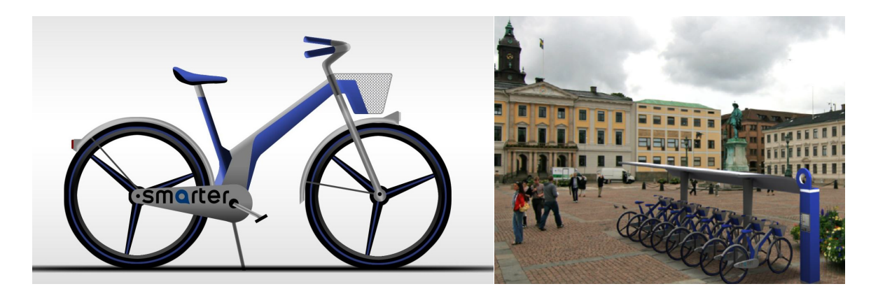
Figure.5 Smarter Bike-Sharing System (Designed by Hjort, Salquist Landin, Sandberg, Sjöstrand & Tangnavarad)