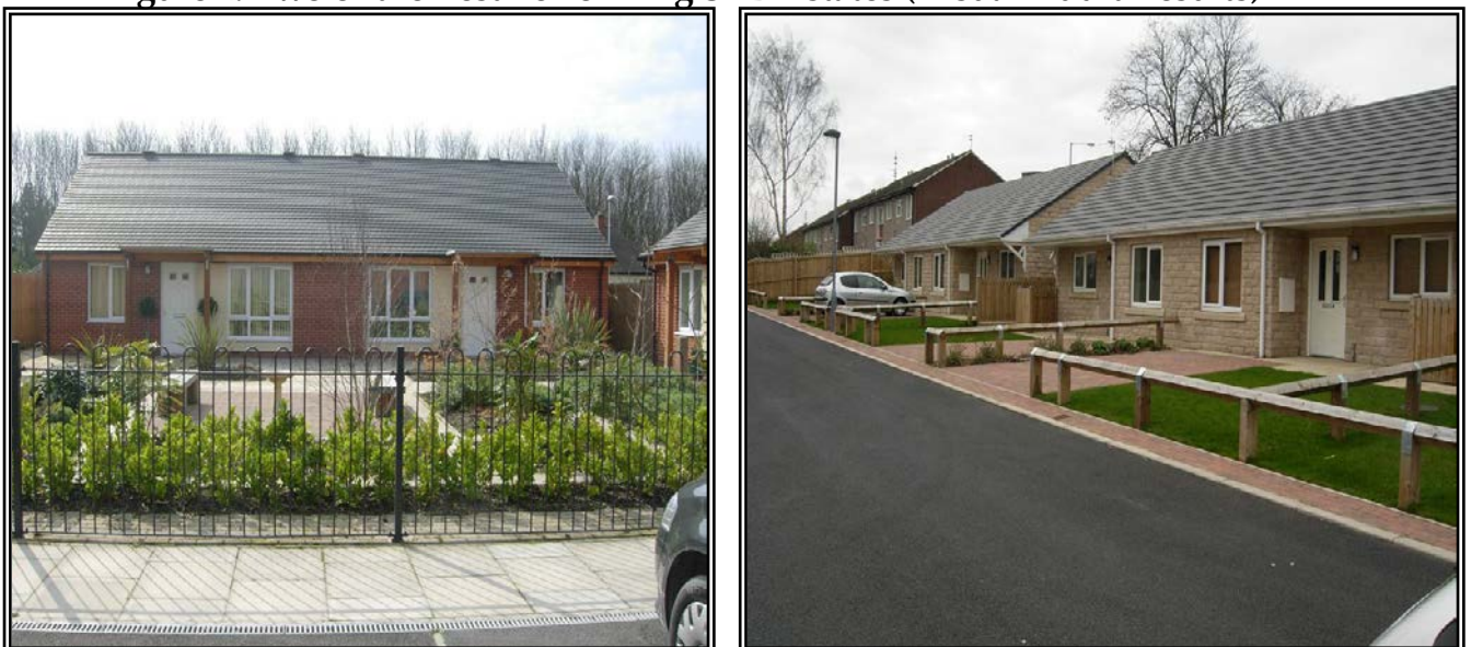
Figure 2: Two of the Best Performing SBD Estates (Visual Audit Results)

Of the 32 developments analysed, the best performing five developments (i.e. those with the lowest scores) were all SBD. The worst performing five developments (i.e. those with the highest scores) were predominantly non-SBD (only one was SBD).