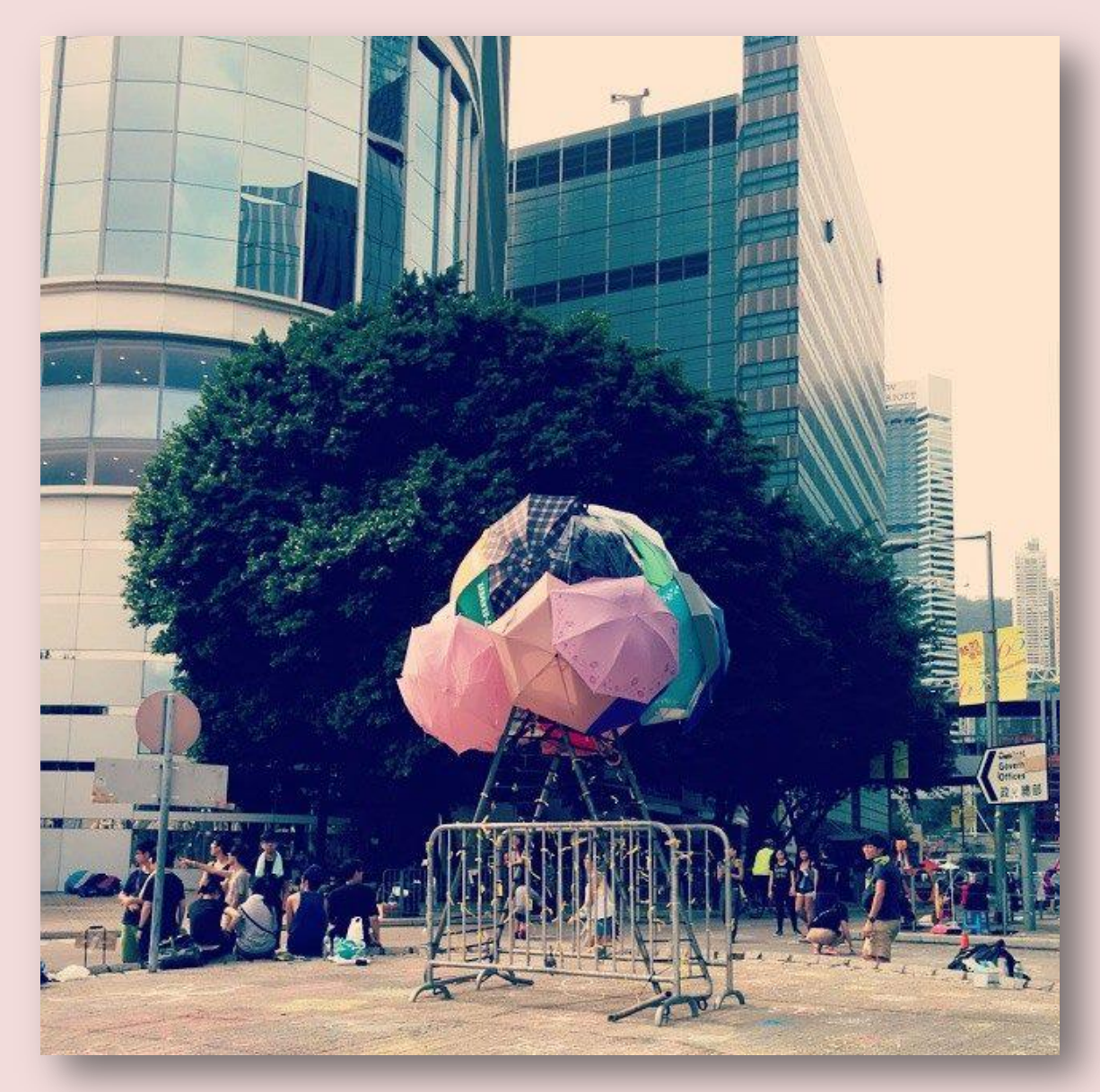
Artists Design Logos for Hong Kong's Umbrella Revolution, posted Friday, October 3, 2014 <a href="http://news.artnet.com/art-world/artists-design-logos-for-hong-kongs-umbrella-revolution-121249">http://news.artnet.com/art-world/artists-design-logos-for-hong-kongs-umbrella-revolution-121249</a>