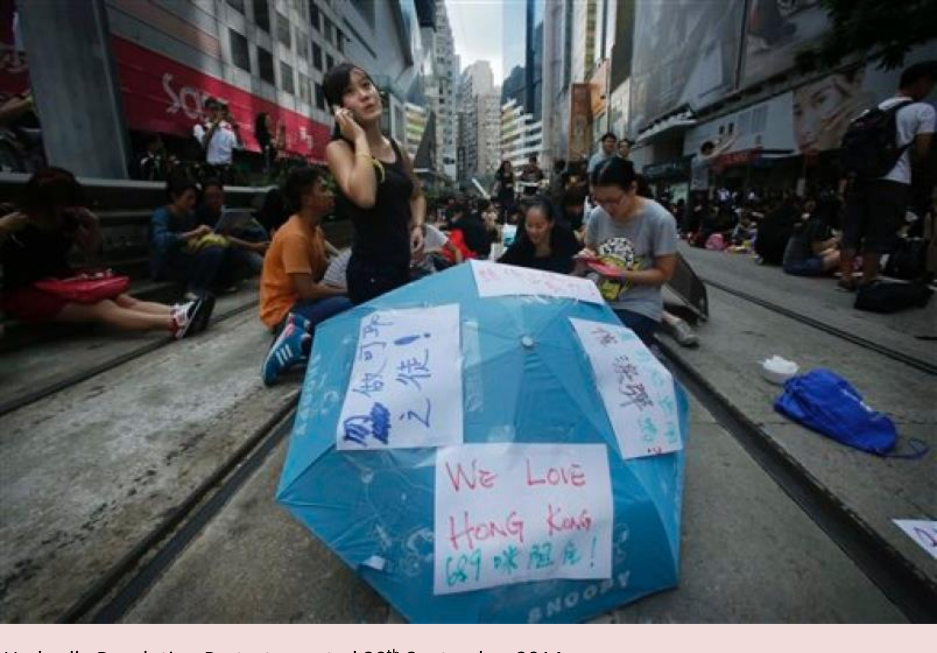
Umbrella Revolution Protests, posted 30<sup>th</sup> September 2014 <a href="http://www.stripes.com/news/pacific/umbrella-revolution-protests-spread-in-hong-kong-1.305574">http://www.stripes.com/news/pacific/umbrella-revolution-protests-spread-in-hong-kong-1.305574</a>