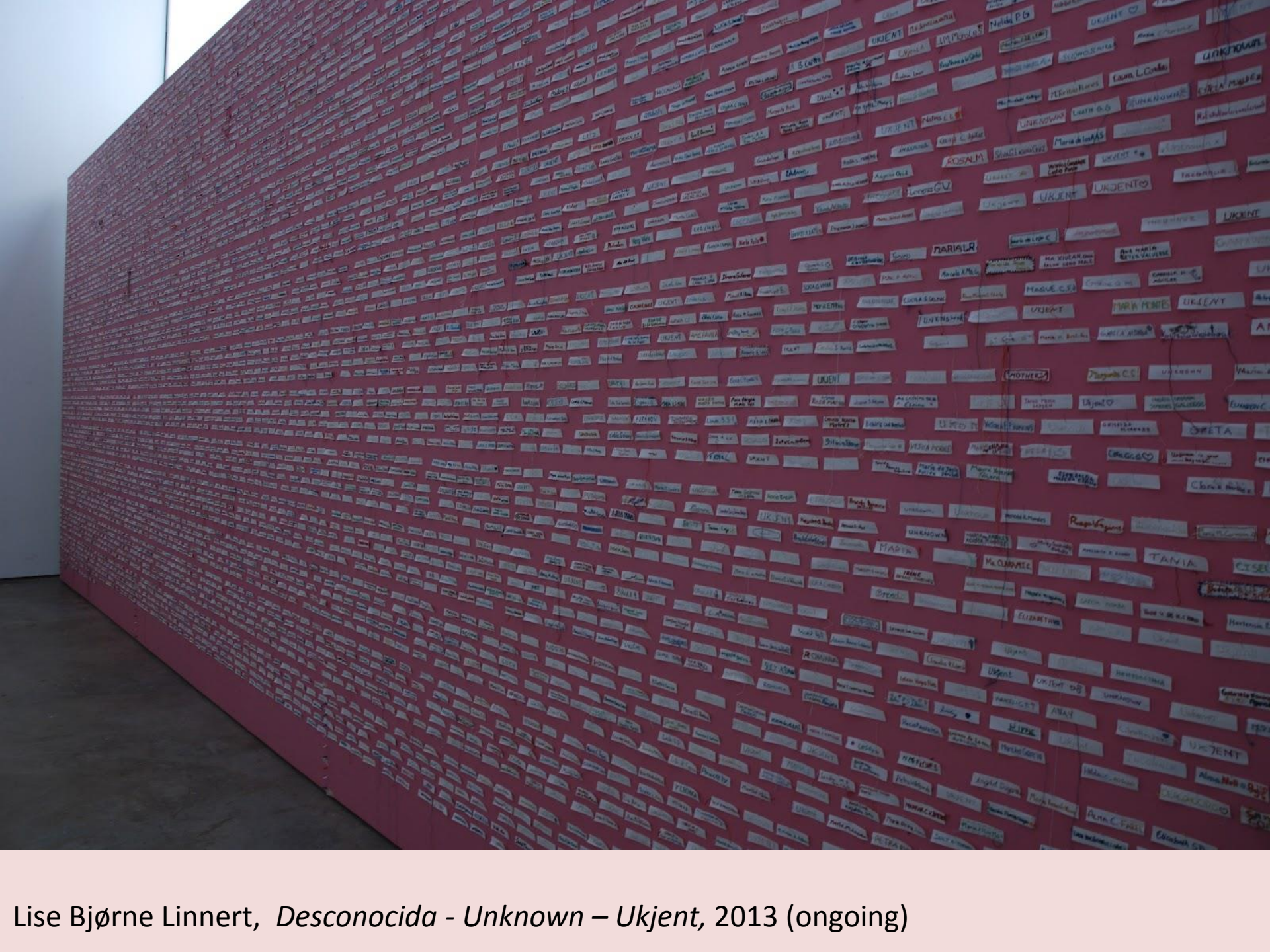
Lise Bjørne Linnert, Desconocida - Unknown – Ukjent, 2013 (ongoing)