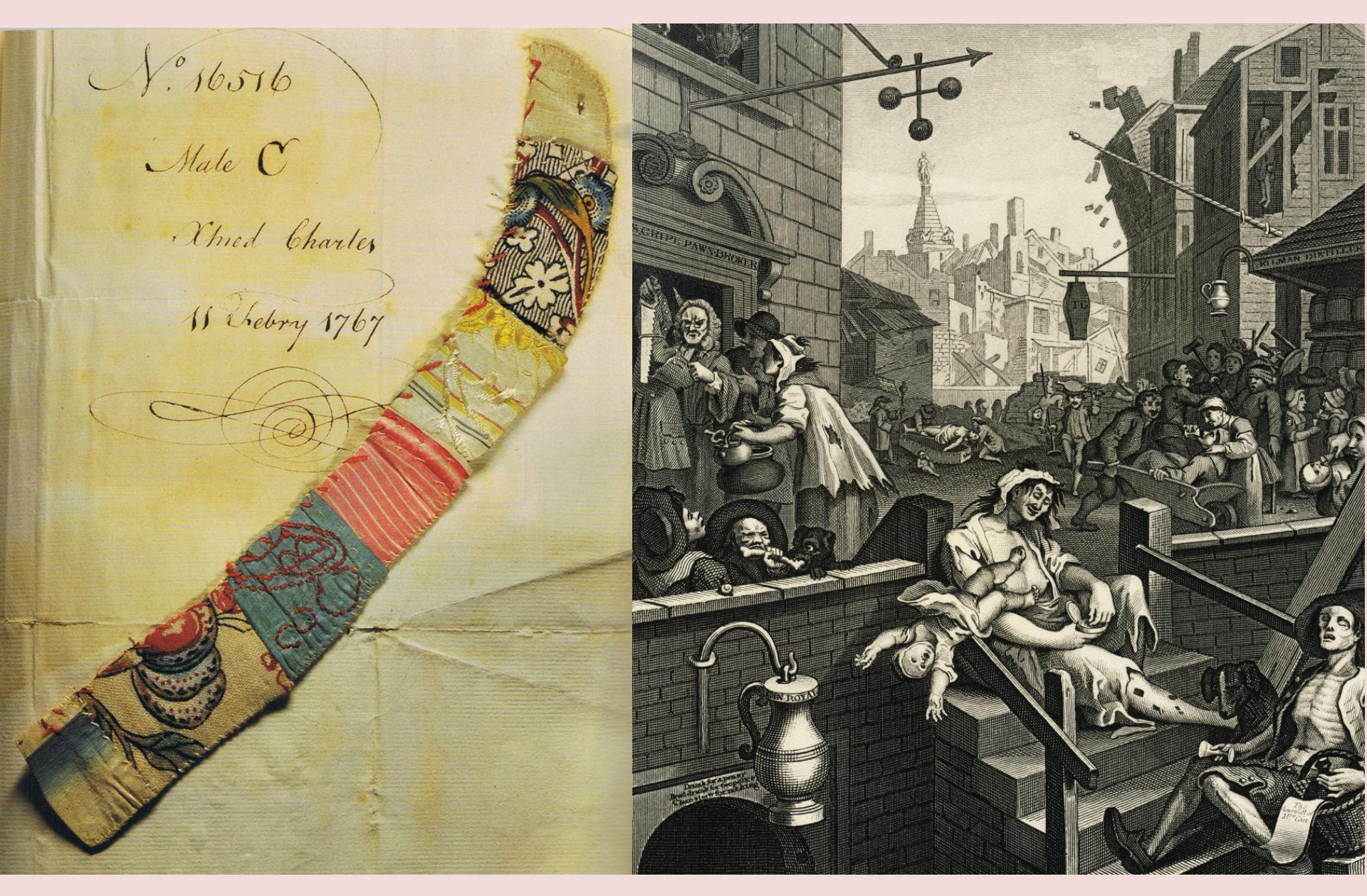
Foundling 16516, 1767